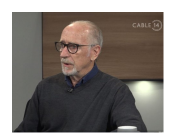
Learning Centre for Hamilton In the Media

"helping children with dyslexia to read"