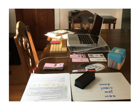
Tutoring from Home