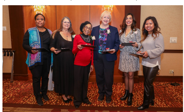
Nominees for the 2022 Woman of Spirit Award

The Woman of Spirit Award was initiated to honour a famous Hamilton woman from our past and one from our present. The award is presented at a luncheon in October, which