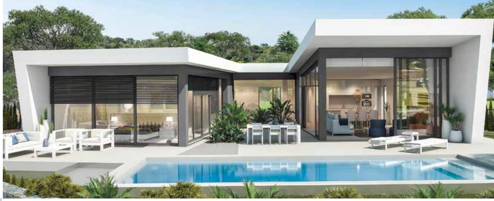
The computer-created image above is shown for illustrative purposes only and as such is not binding. The final design may be subject to changes.