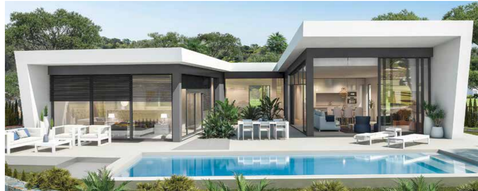
The computer-created image above is shown for illustrative purposes only and as such is not binding. The final design may be subject to changes.

The residential offering on sale at Las Colinas Golf & Country Club includes villas and apartments.