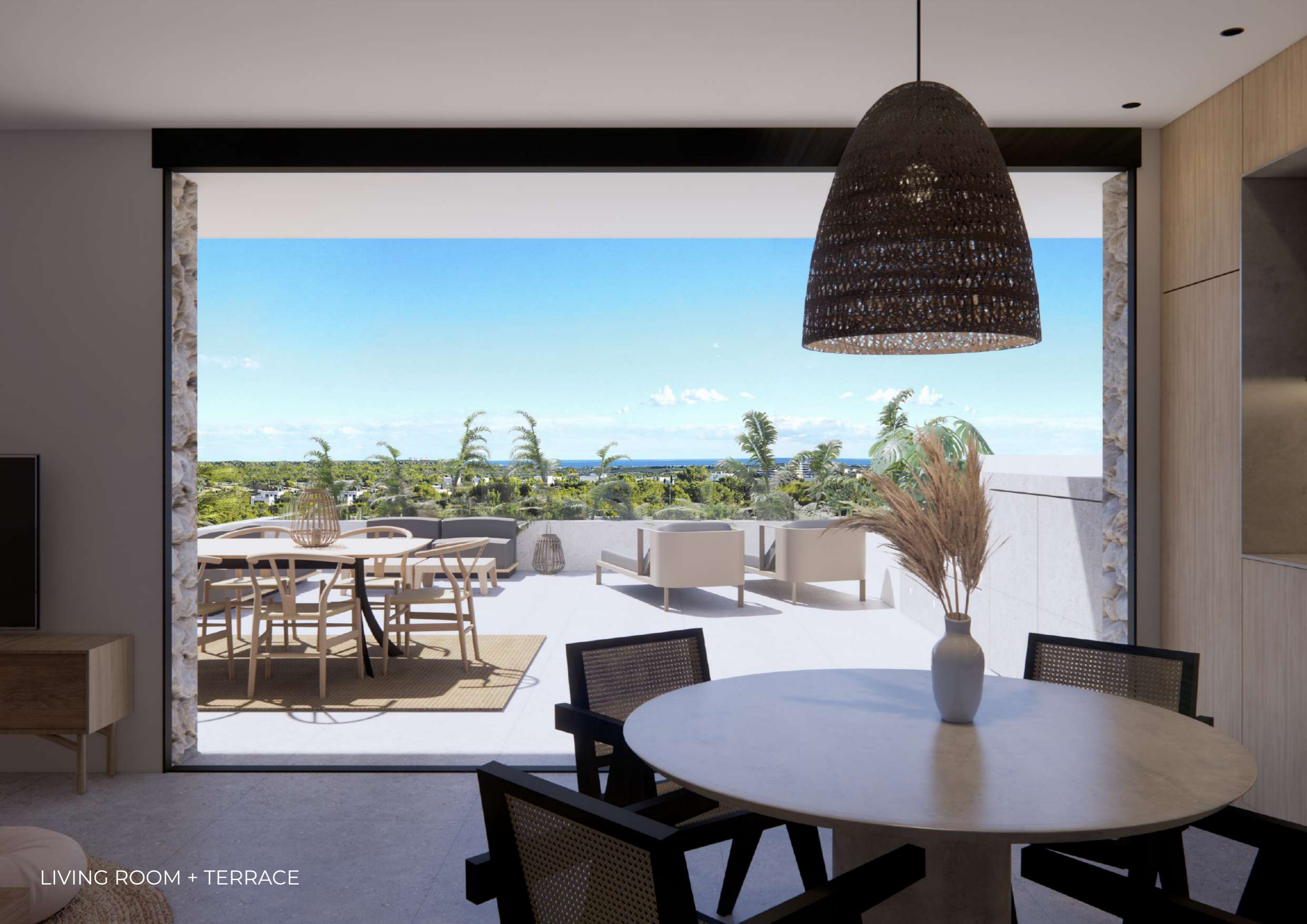
LIVING ROOM + TERRACE