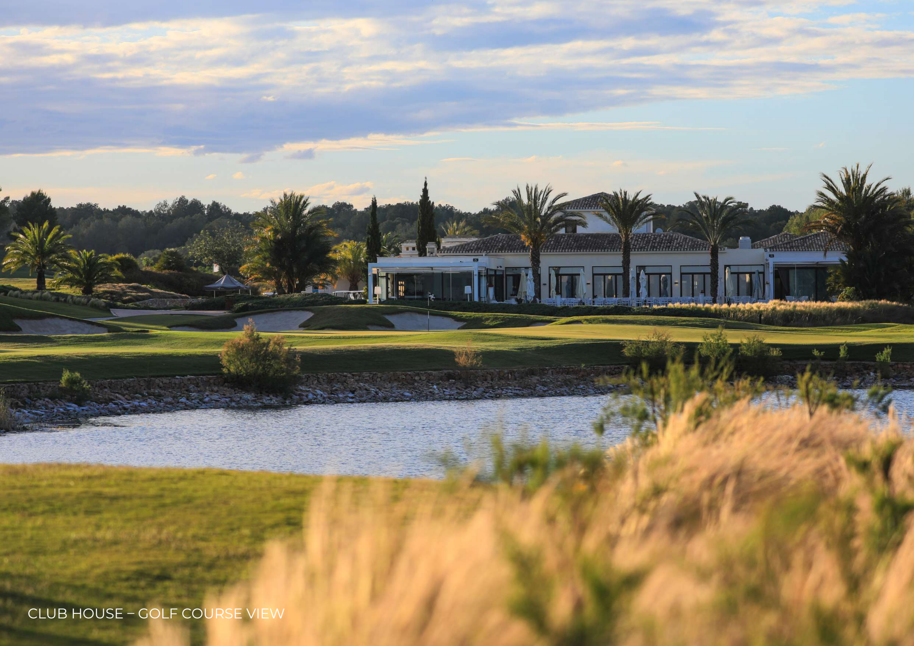
CLUB HOUSE – GOLF COURSE VIEW