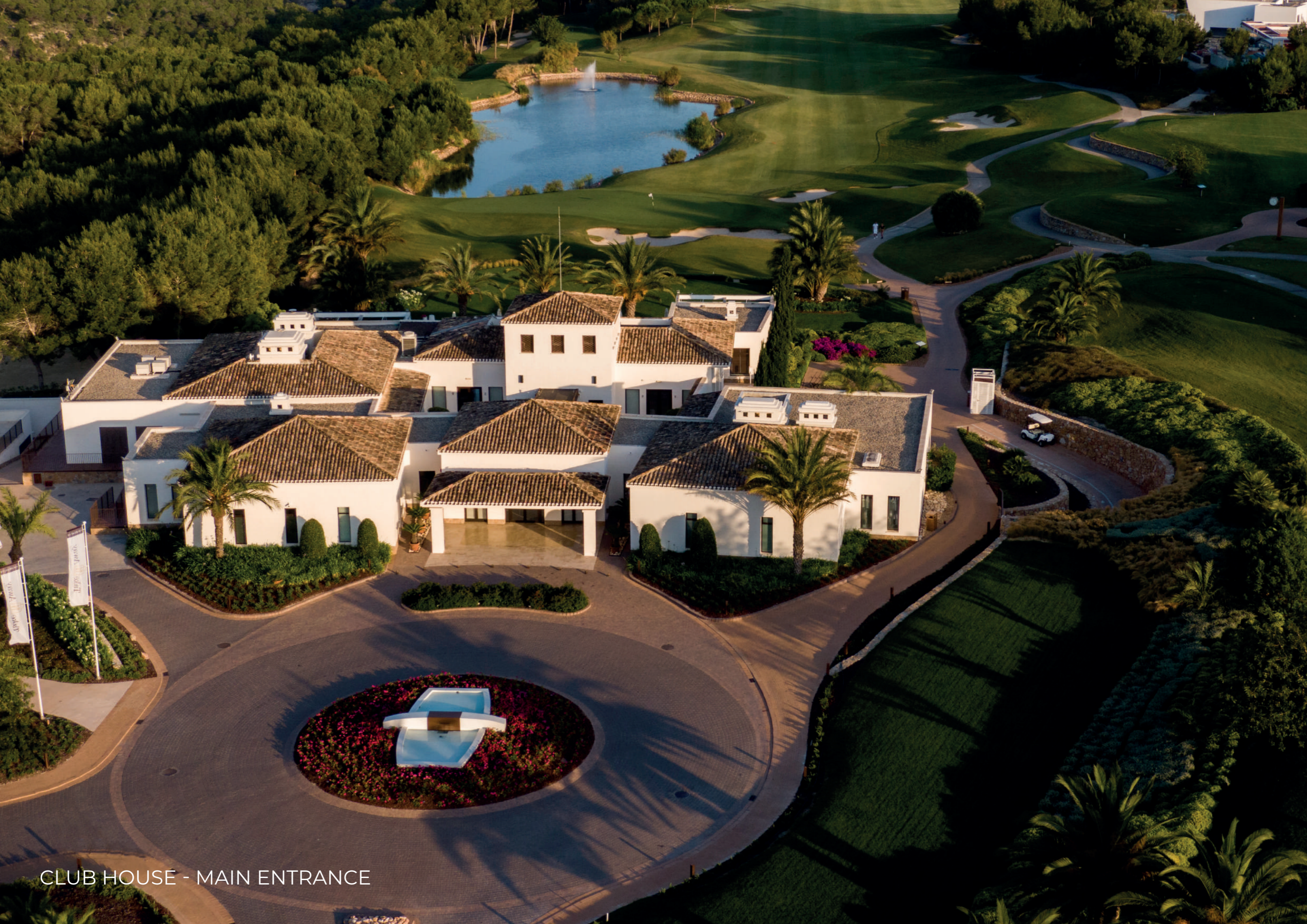
CLUB HOUSE - MAIN ENTRANCE