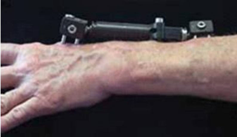
An external fixator.

Open fractures. Surgery is required as soon as possible (within 8 hours after injury) in all open fractures. The exposed soft tissue and bone must be thoroughly cleaned (debrided) and antibiotics may be given to prevent infection. Either external or internal fixation methods will be used to hold the bones in place. If the soft tissues around the fracture are badly damaged, your doctor may apply a temporary external fixator. Internal fixation with plates or screws may be utilized at a second procedure several days later.