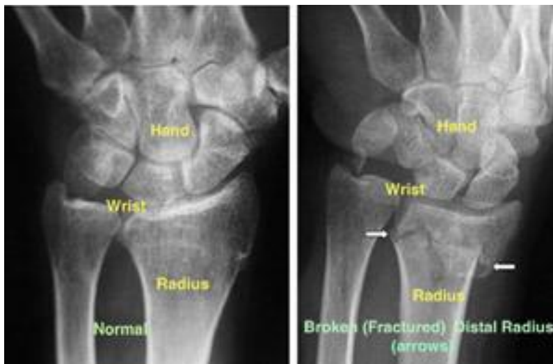
(Left) An x-ray of a normal wrist. (Right) The white arrows point to a distal radius fracture.

To confirm the diagnosis, the doctor will order x-rays of the wrist. X-rays are the most common and widely available diagnostic imaging technique. X-rays can show if the bone is broken and whether there is displacement (a gap between broken bones). They can also show how many pieces of broken bone there are.