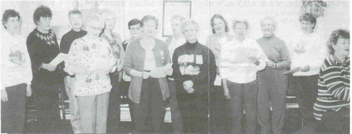
Austin & Area Millennium Senior Choir - second practice. "Where are the guys?"