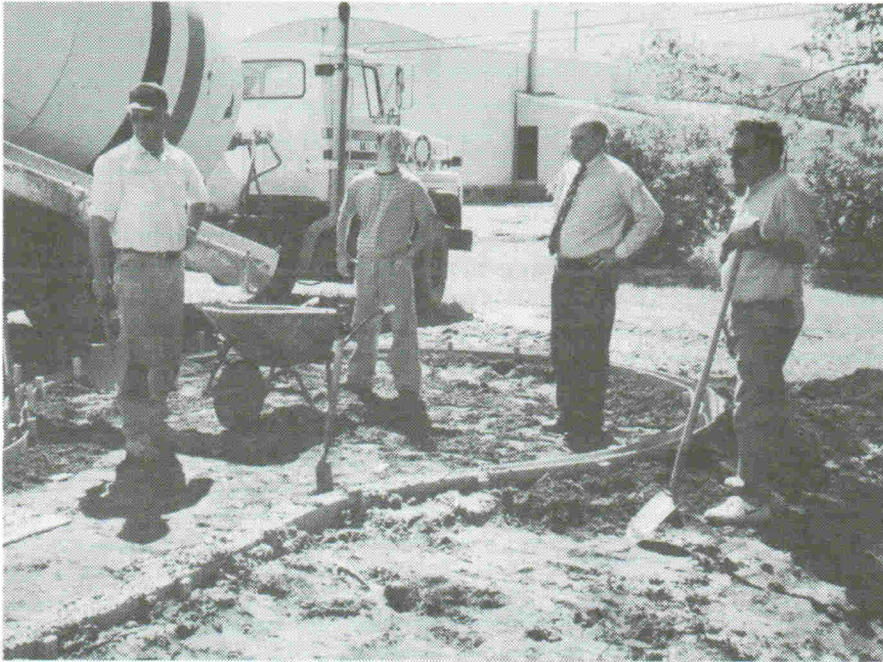
The way it was. Park beginnings.

downtown green space. Their vision was that a vacant lot on Hampton could be transformed into a park area. The proposal was successful and $4,000.00 was granted toward the development of the park.