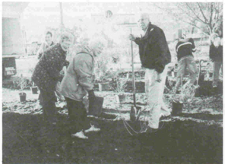
Inter-generational effort for I.Y.O.P. Millennium Park

How did all of this come about? The Manitoba Seniors' Directorate provided the incentive by offering a grant for a worthy proposal that would fit with the International Year of Older Person (I.Y.O.P.). The Foundation and the Village saw a need for a