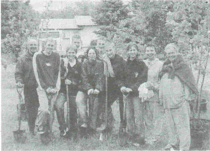
M.C.I. Tree Planting 1999

streets. There are plantings at the elementary school, the collegiate, the community centre, the ball diamonds, Centennial Park, the railway, the golf course, Fotheringham Drive, the hospital and the walkway across the creek. And how did they get there?