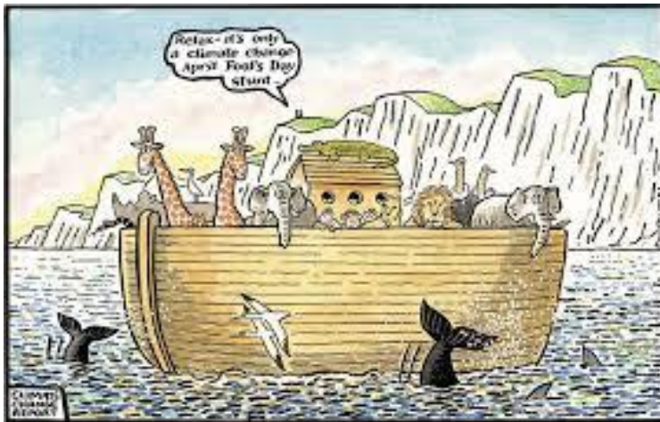
'Relax. It's just a Climate Change April Fool's Stunt'