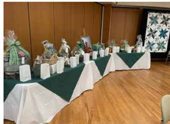
Raffle Items from 2023 Winter Seminar

In addition to the outstanding presentations for this full day seminar, raffle baskets will entice attendees with a wide variety of gardening items and gift cards from local businesses.