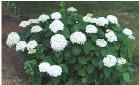
These photos were taken at the end of July.

One of our members took a friend's advice and, when the stems reached 12 inches, pruned them back just above a leaf set to a height 8 inches. The bifurcation results in two smaller, later blooming flowers per stem that hold up much better when it rains.. It appears that the plant will continue to produce prime blooms over a longer period.