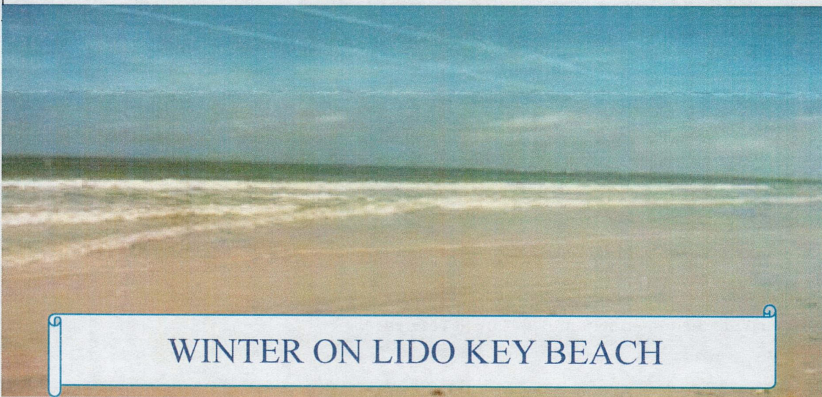
WINTER ON LIDO KEY BEACH