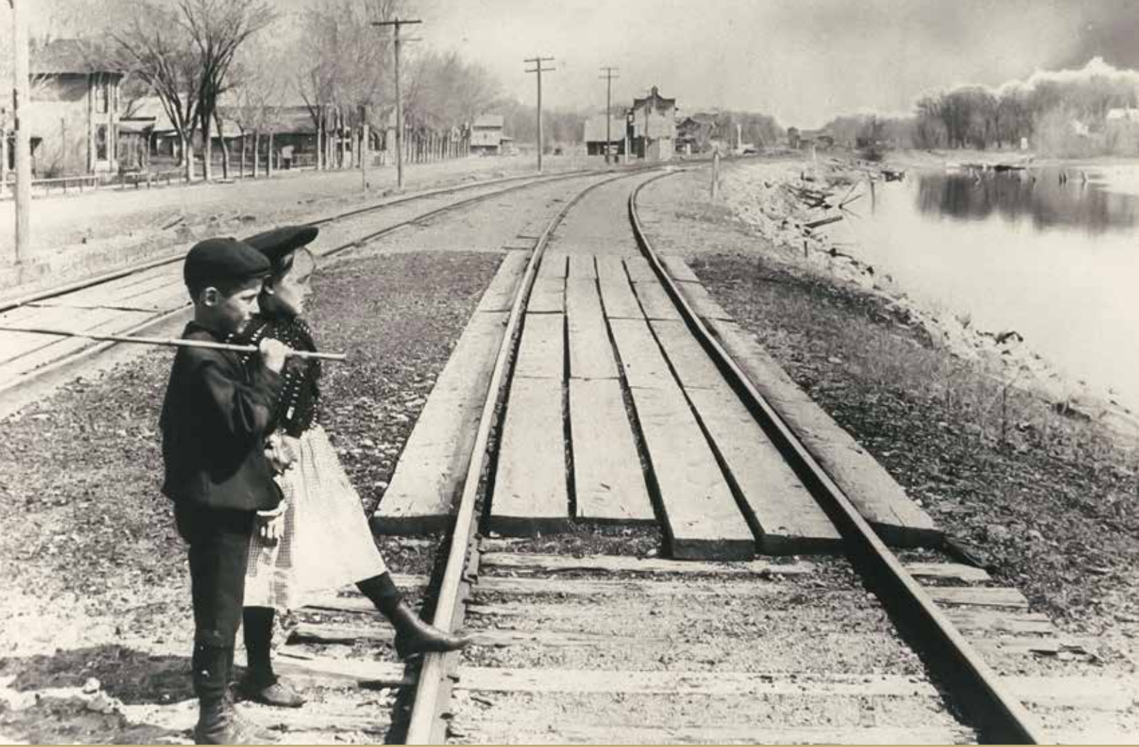
Children crossing the railroad tracks, 1910s. Pictured are the double tracks which once ran through Wayzata.