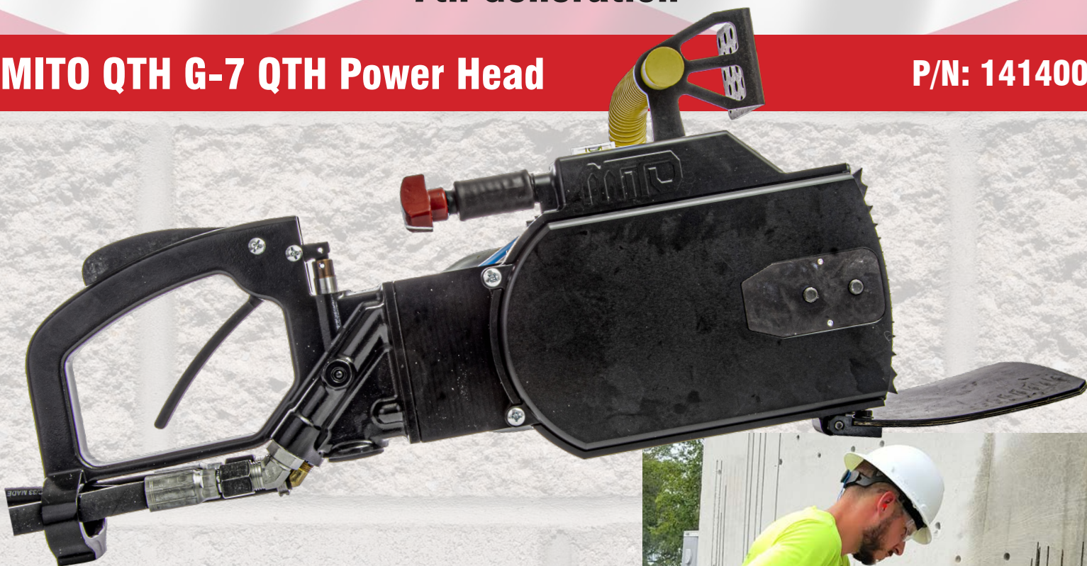
Tool Free Chain tensioning