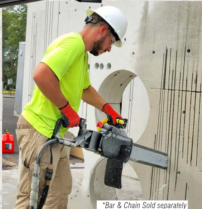
*Bar & Chain Sold separately