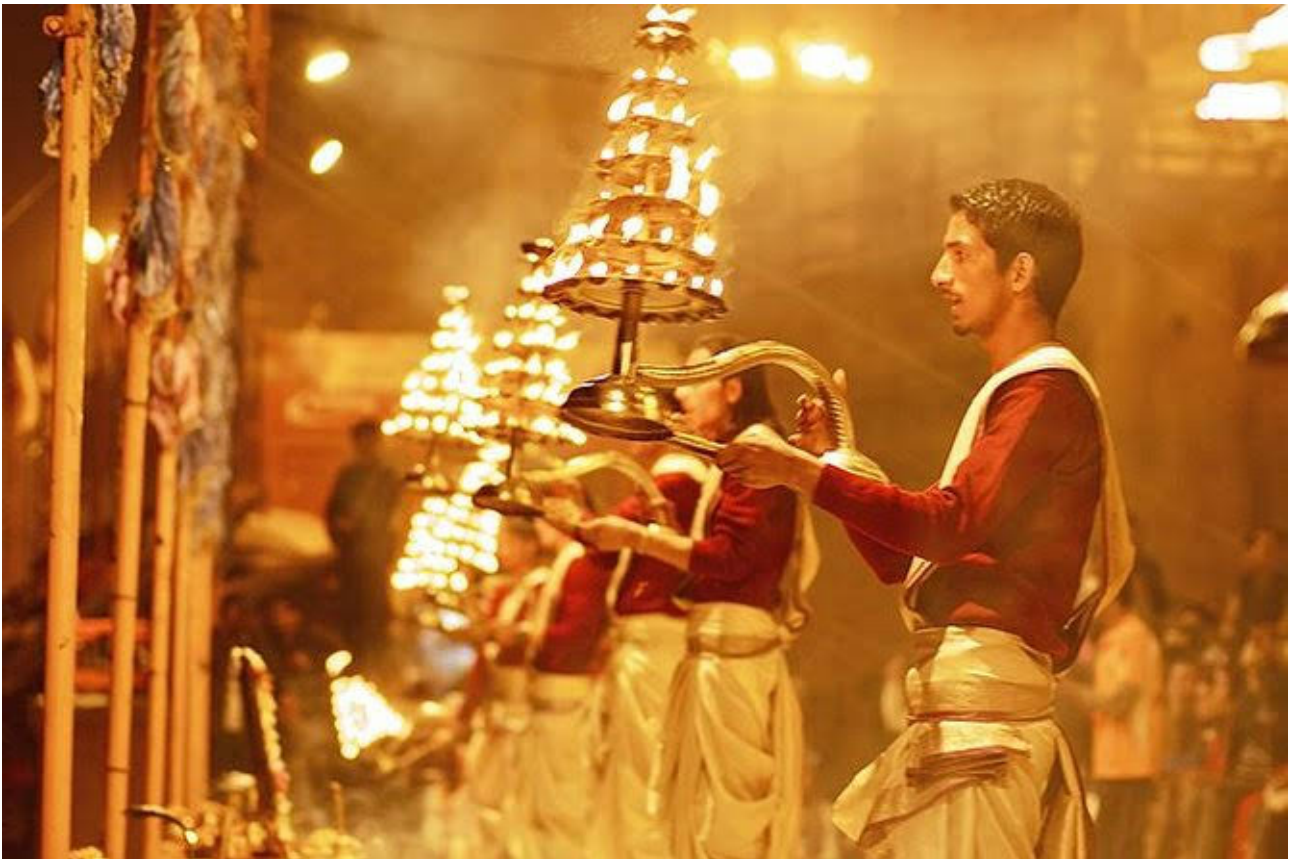
Evening Aarti, Varanasi

This family perform puujas and rites every day and night time, come rain or shine, including Morning & Evening Aarti (a powerful sunrise/sunset ritual throughout India; which in Varanasi takes on particular significance being also a purifying ceremony for the dead).