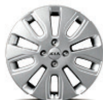
16" alloy wheel