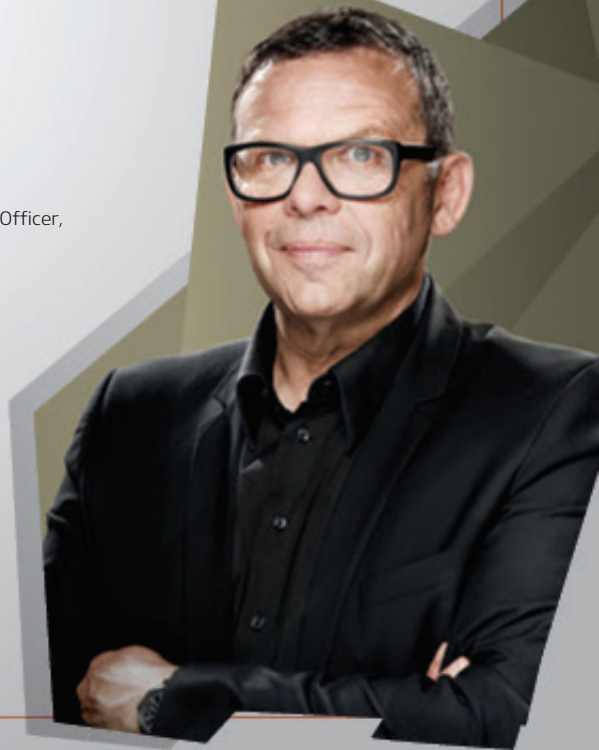
PETER SCHREYER President and Chief Design Officer, Kia Motors Corporation

To ensure that the 2015 Kia Rio exceeds the highest standards of design, technology and quality, Peter Schreyer — one of the world's top 3 automotive designers — thoroughly oversees every aspect in its design direction. For Schreyer, each element should bear the 'absolute purity' in order to create the design as a whole. The 'simplicity' philosophy is at the core of Kia's creative language.