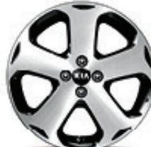
17" alloy wheel