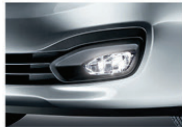
LIGHTING. Fog lights make it easier to see – and be seen – in the dark of night or in inclement weather. Standard on Rio EX and SX models.

Drive the Rio and along with power, efficiency and performance come low emissions and reduced fuel consumption, not to mention safety specifications of the highest order. From a structural framework that absorbs impact forces in both frontal and side-on collisions to a range of active and passive safety measures, the Rio is built to protect those that matter.