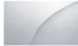
Polar BC / BL / BEL