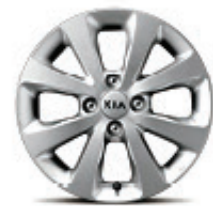
15" alloy wheel