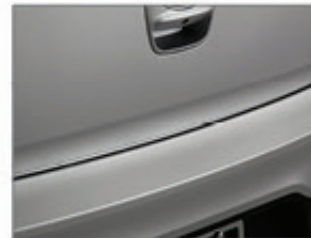
Rear bumper applique

Kia Genuine Parts and Accessories are engineered by Kia and installed by professionals at your Kia dealer. For more information on the full line of available Genuine Kia Parts and Accessories, see your local Kia dealer, visit www.kia.ca or call 1-877-542-2886.