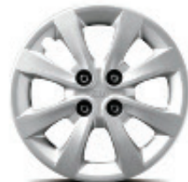
15" steel wheel with full cover