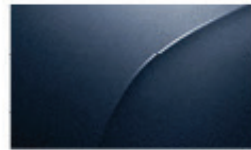
Midnight Sapphire (P) BC / BL / BEL