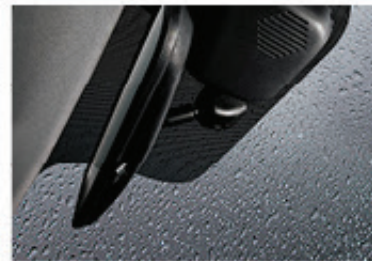
RAIN SENSING WIPERS. The windshield wipers are automatically activated as soon as moisture is detected for greater convenience and visibility. Standard on Rio SX models.