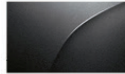
Graphite (P) BC / BL