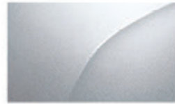
Sterling (M) BC / BL