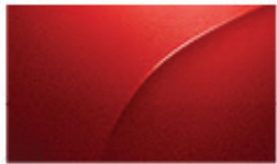
Chili (P) BC / BL