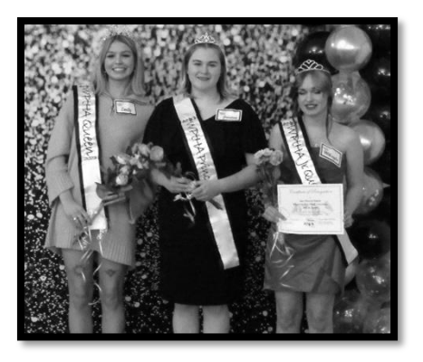
Pizza Parties & Games Youth Mentor Program Free Stall at WPtHA Show Youth Sportsmanship Award

Youth Pinto Drawing Contest Hippology Contest Scavenger Hunt Free Banquet Dinner