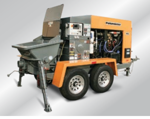
Thom-Katt Series — Tier 4 Final