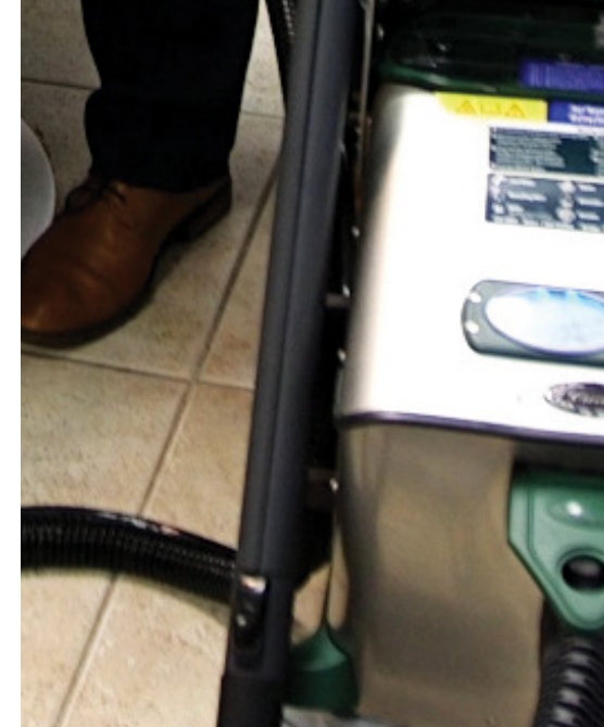
Medical / Dental Offices