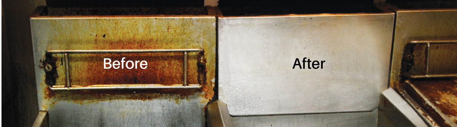
Restaurants / Bars