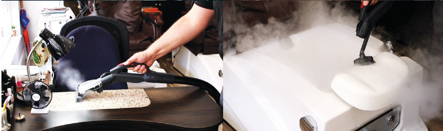
Salons / Spa's