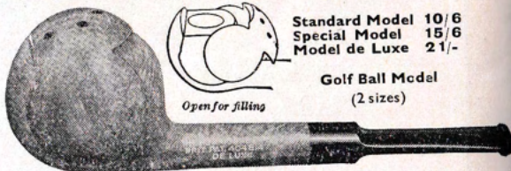
Open for filling

Standard Model 10/6 Special Model 15/6 Model De Luxe 21/-