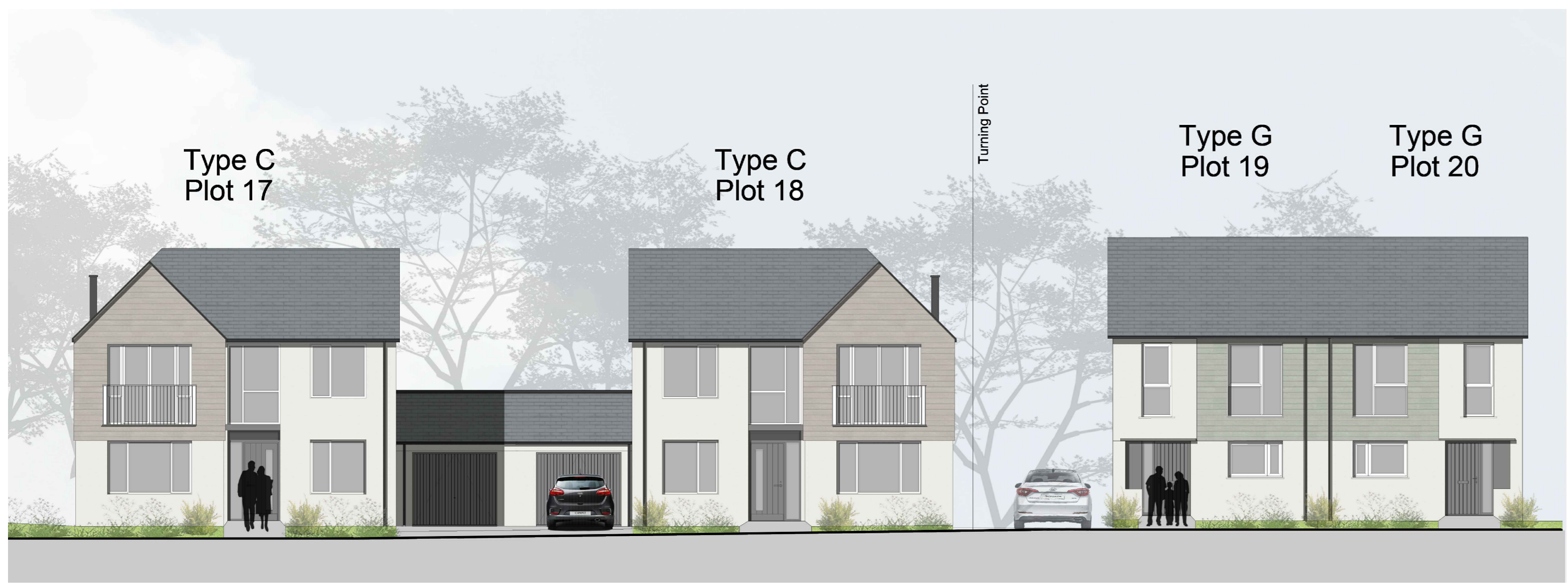
Street Scene B-B

This line should measure 80mm when printed correctly This drawing is the copyright of Roberts Limbrick, Ltd and should not be reproduced in whole or in part or used in any manner whatsoever without their written permission. Responsibility is not accepted for errors made by others in scaling from this drawing. Use only figured dimensions and report any discrepancies or omissions to the Architect immediately. P01 20.06.2023 LM SCR First Issue Updated levels information and single garage added to plot 1 (Sheet Scene C-C) A 29.06.2023 LM CG Updated levels information and single garage added to plot 1 (Sheet Scene C-C)