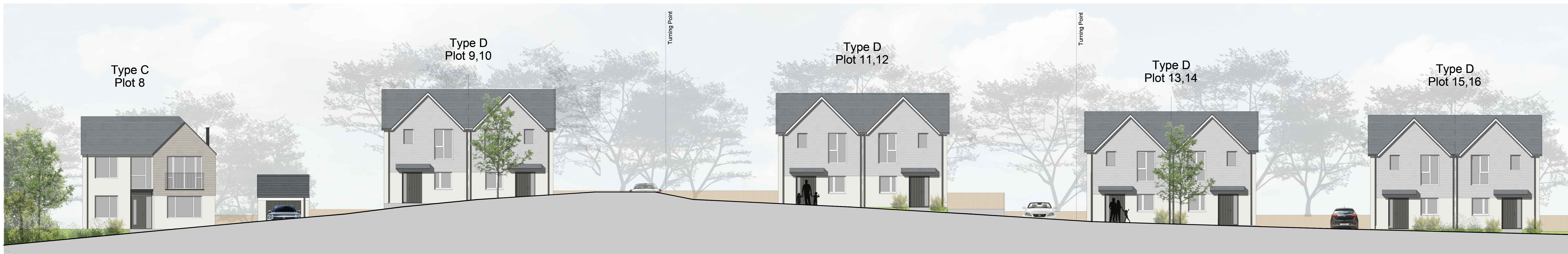
Street Scene D-D