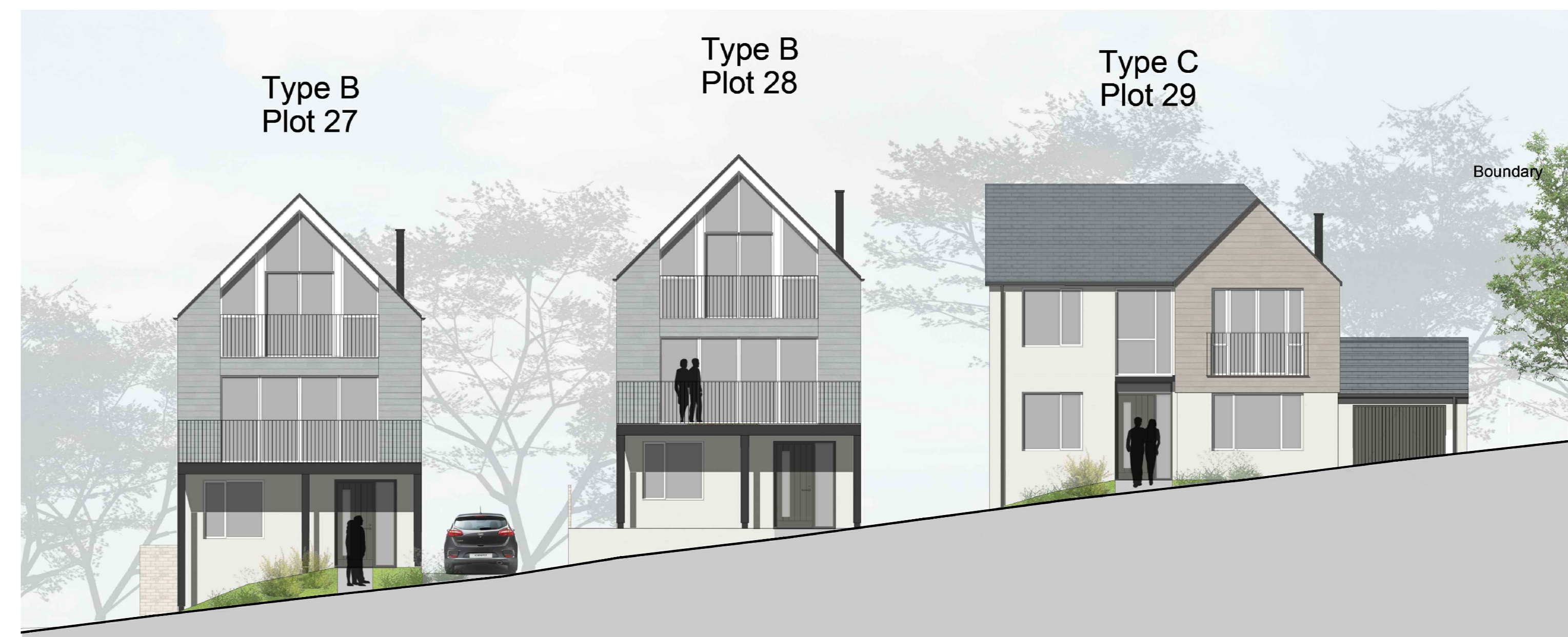
Street Scene E-E