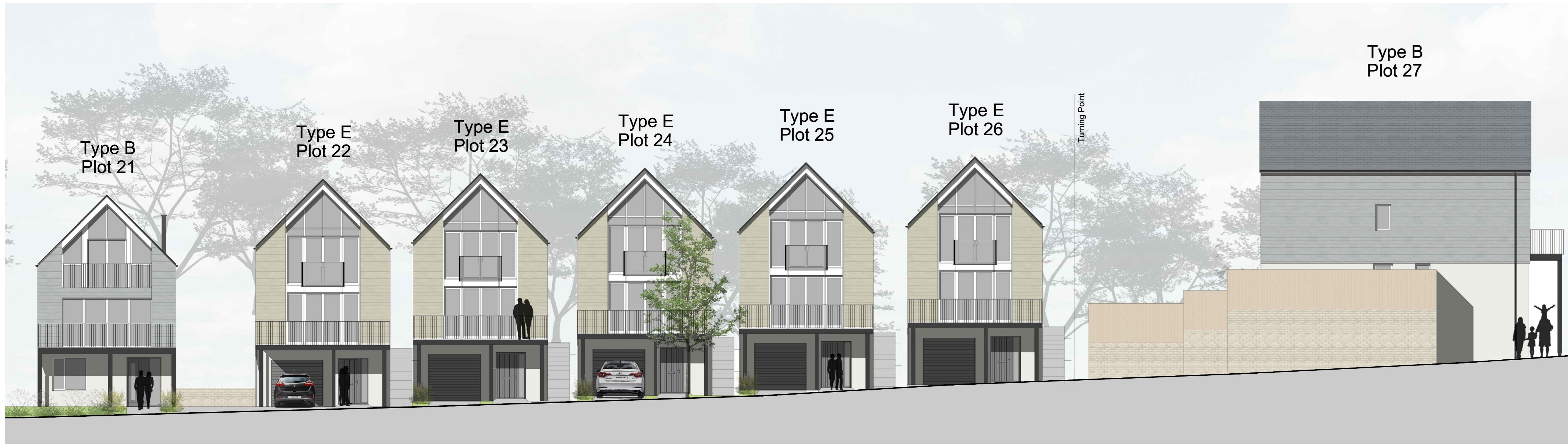
Street Scene A-A