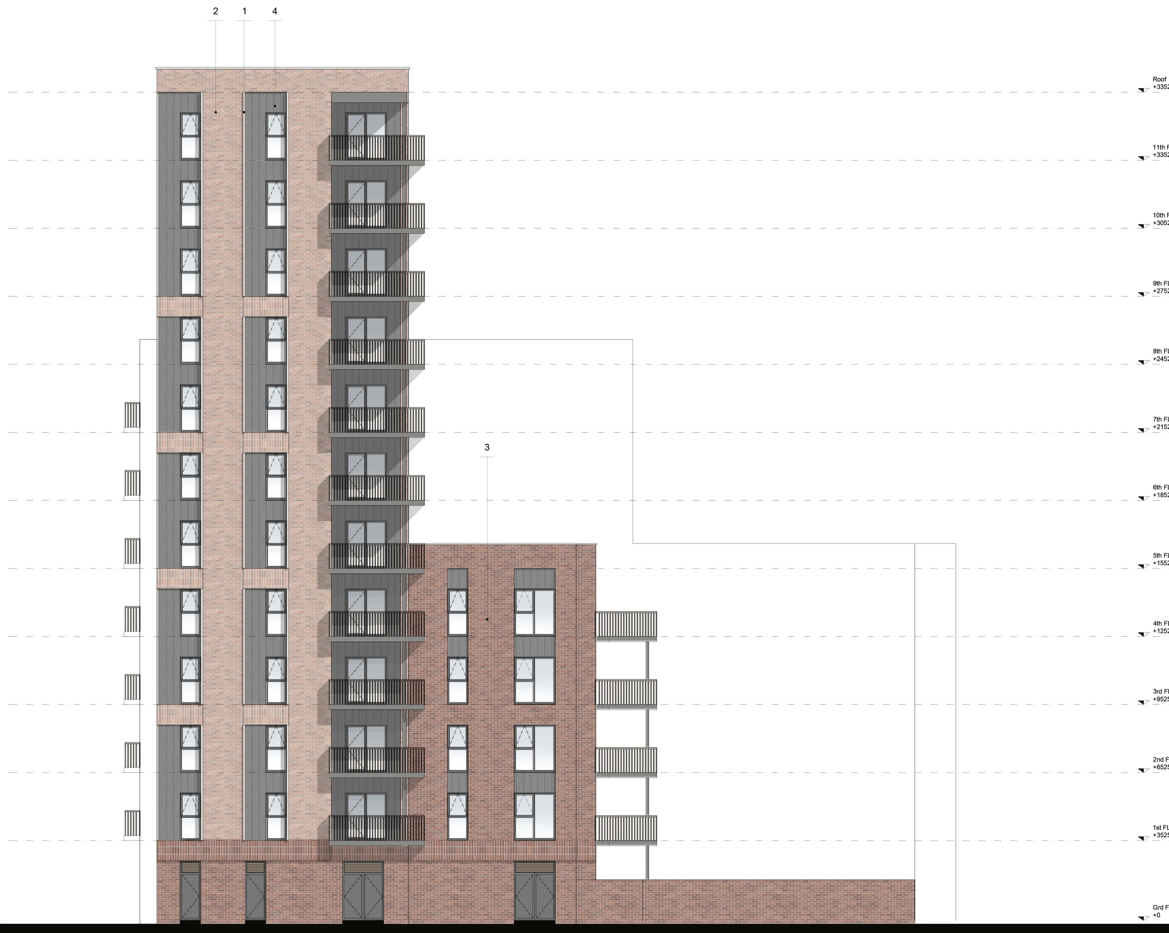
South-East Elevation (2)