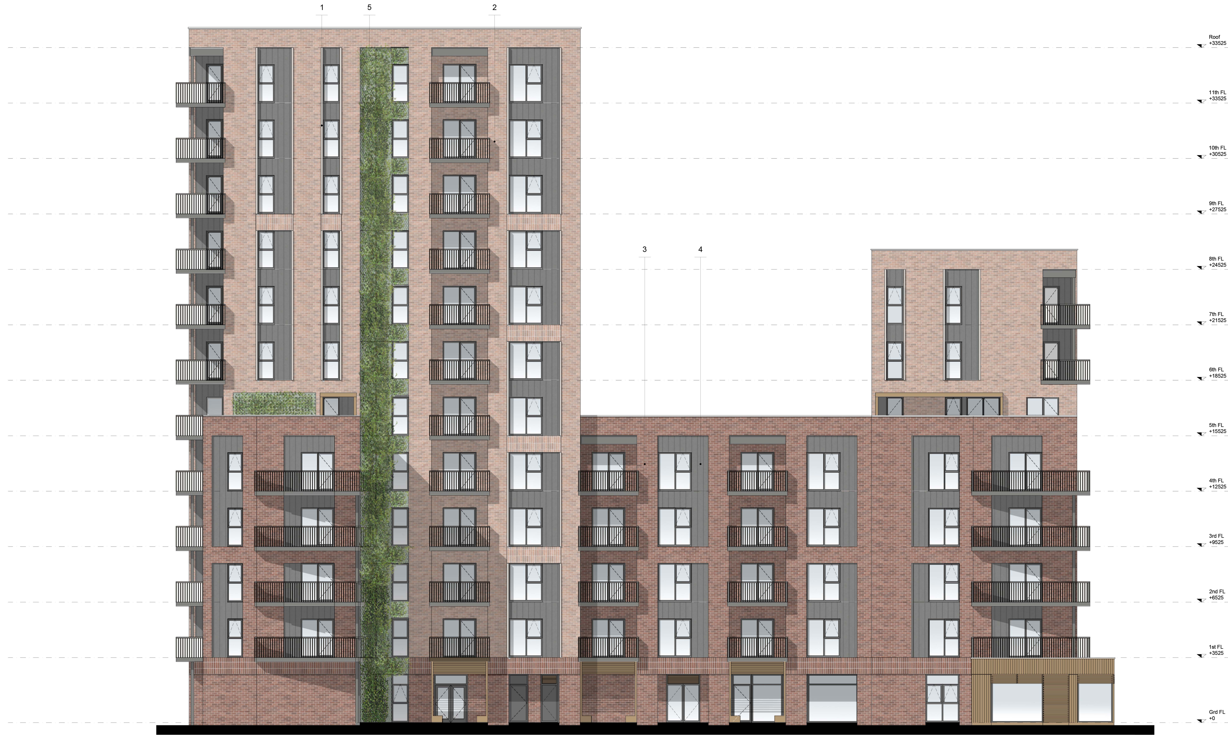
North-East Elevation (3)