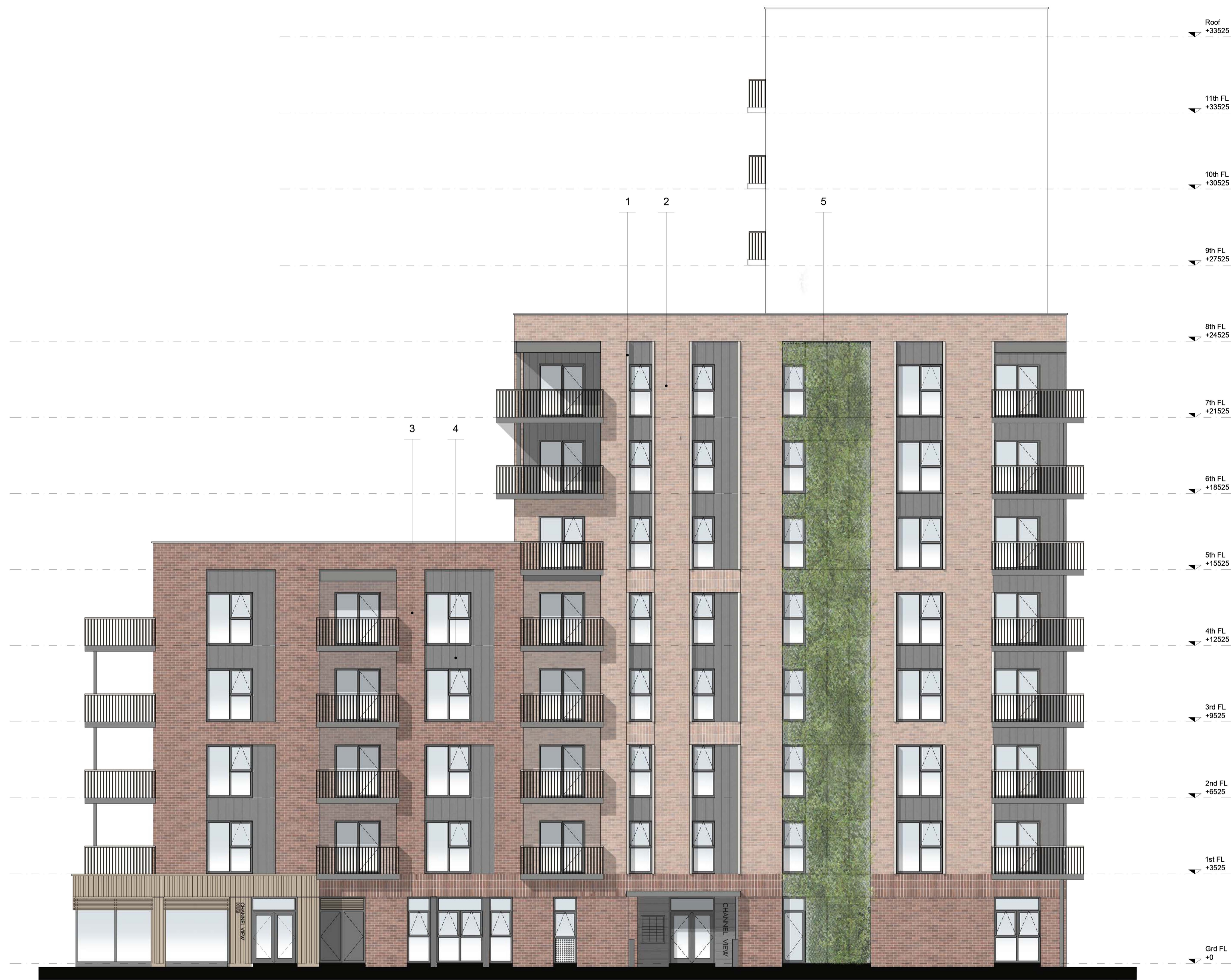
North-West Elevation (4)