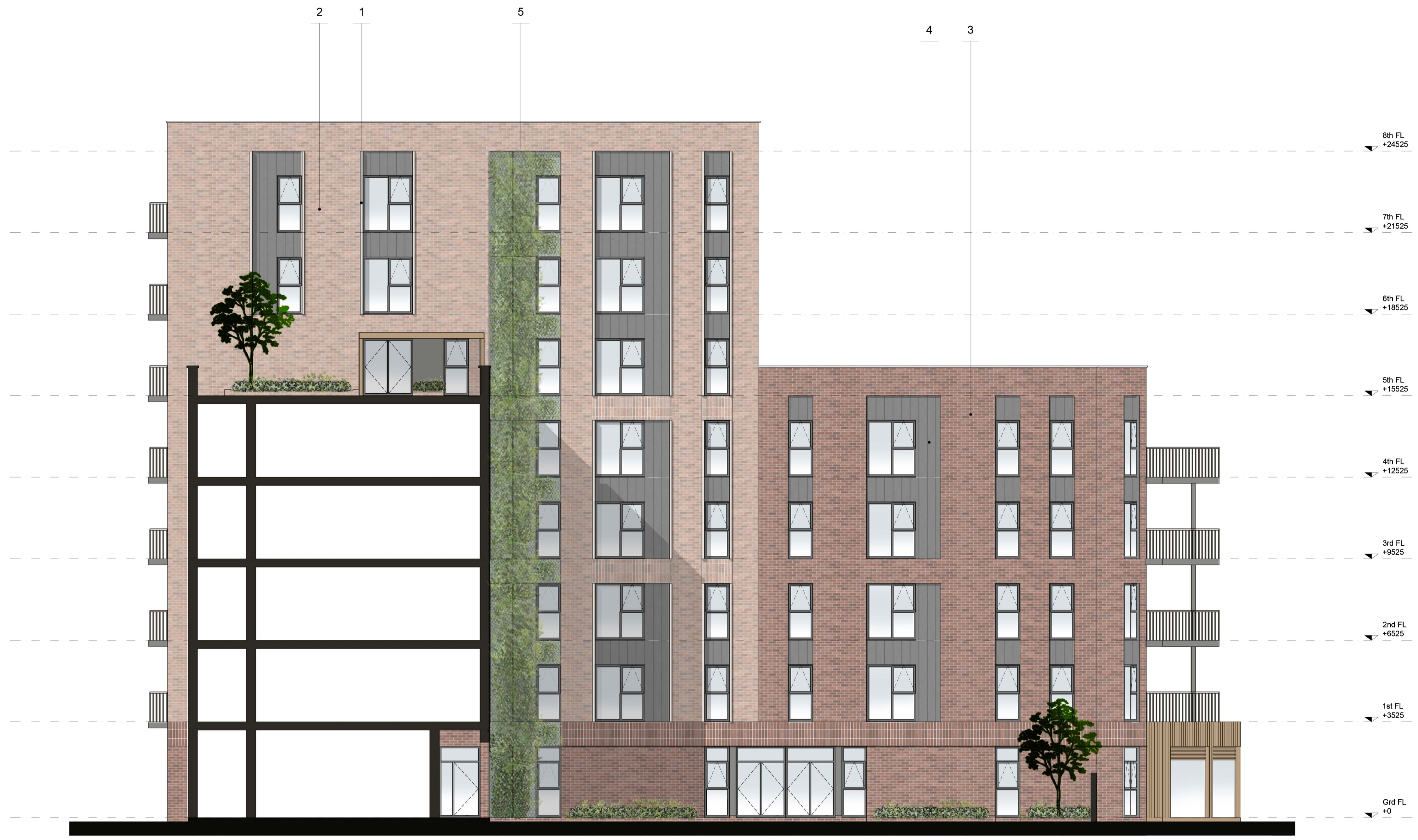
South-East Elevation (5)