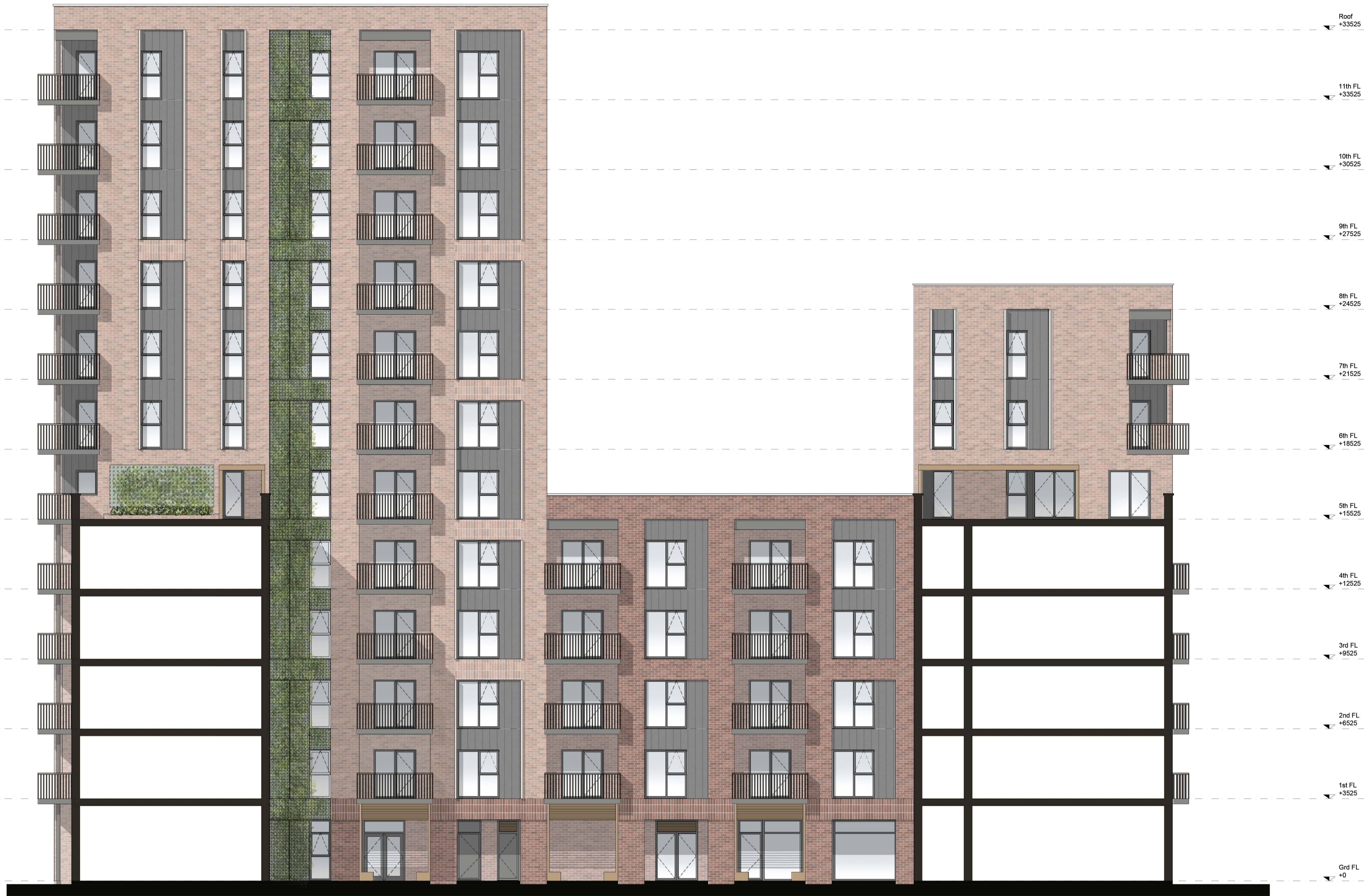
North-East Elevation (7)