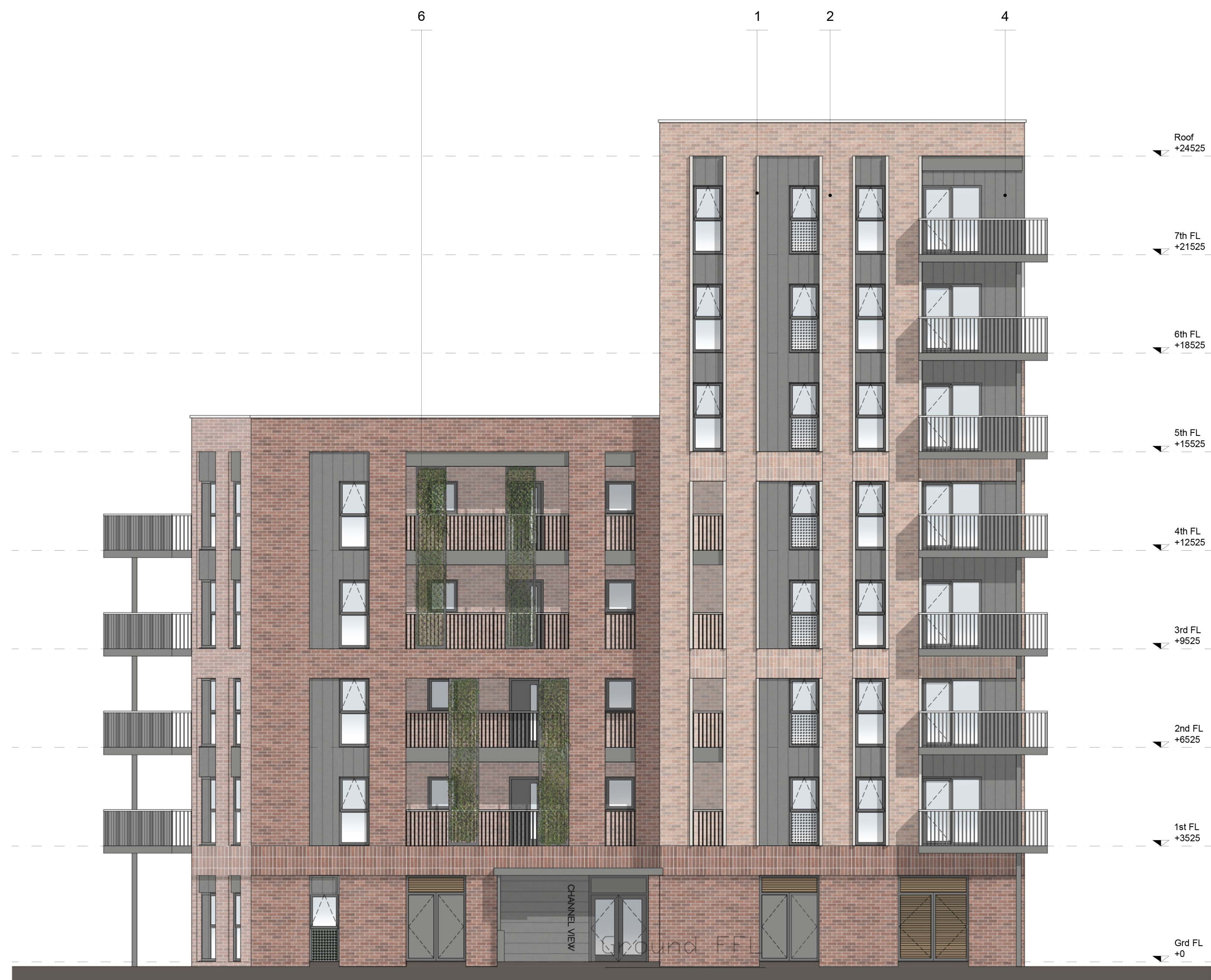
North- West Elevation (1)