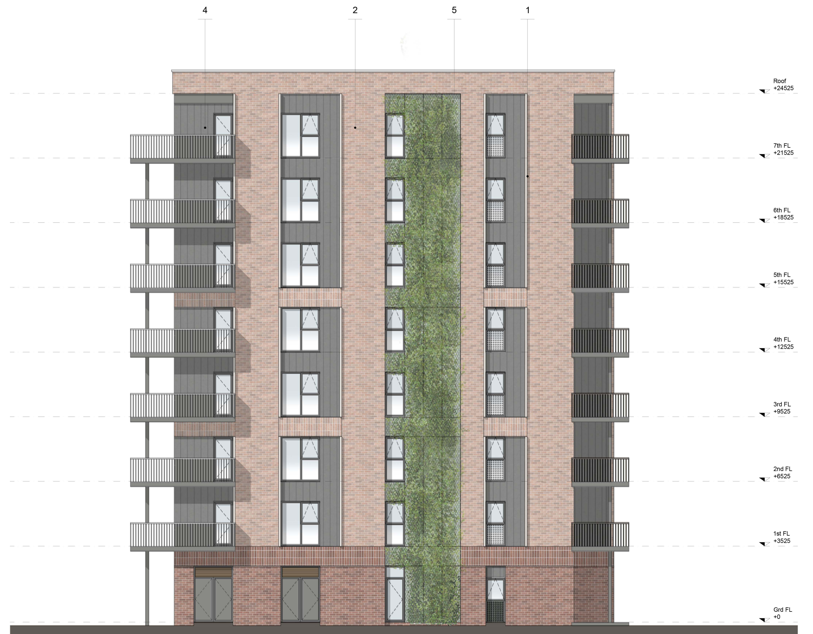
South-West Elevation (2)