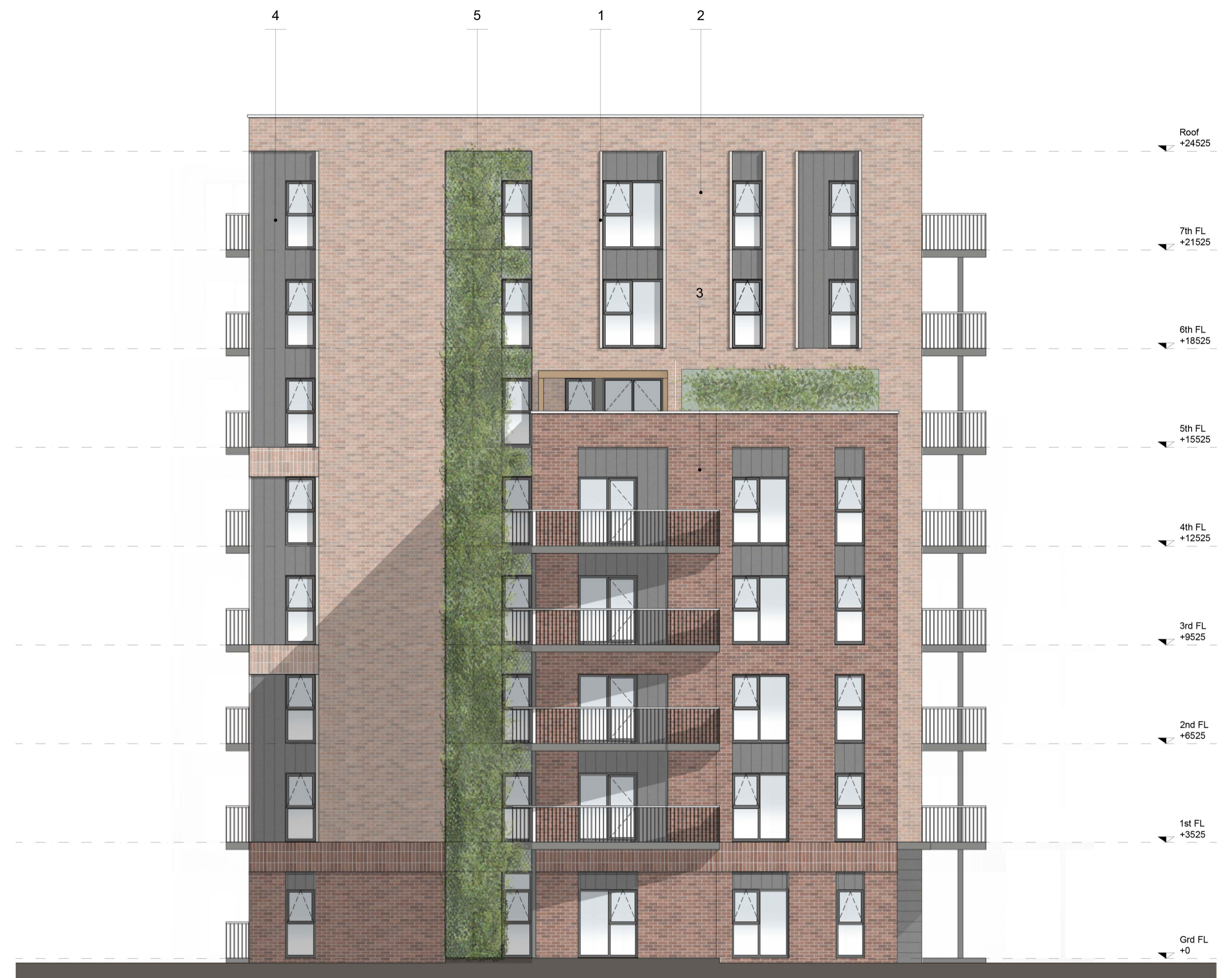
North-East Elevation (4)