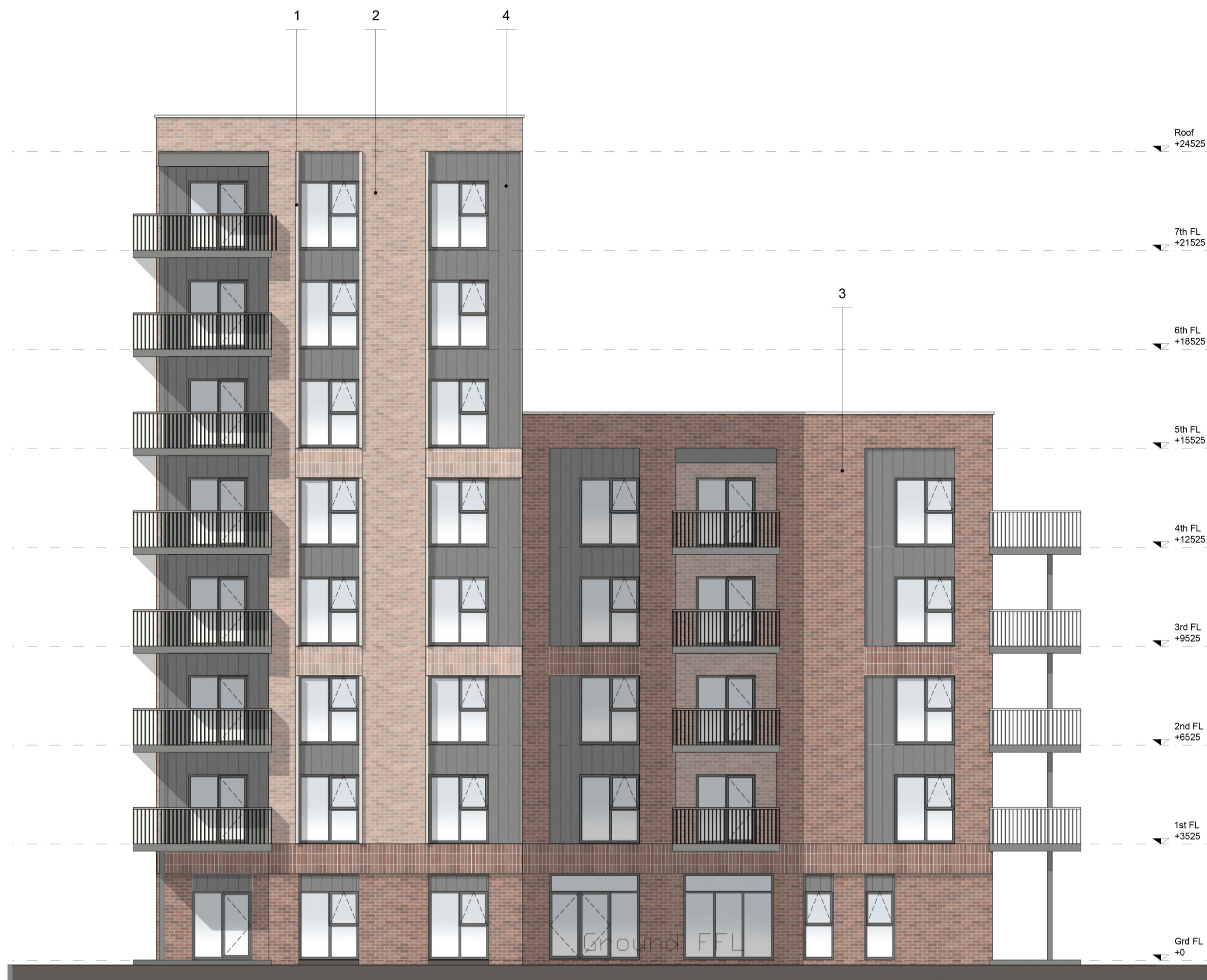
South-East Elevation (3)