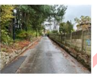
Plas Bryn Rhosyn Care home façade along the site entrance road.