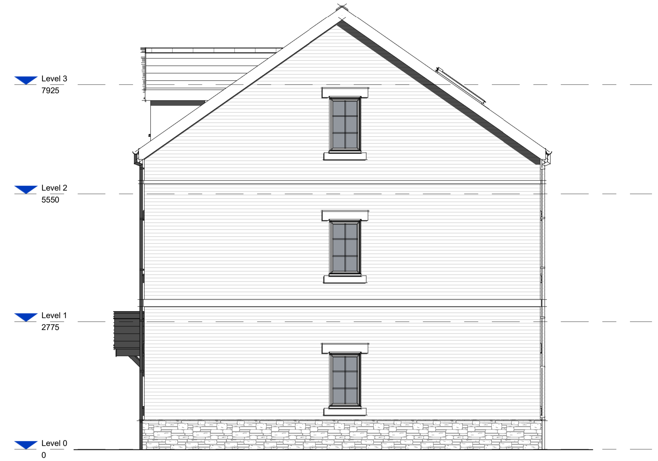
Side elevation 1 (Block 1 & 2) 1 : 50