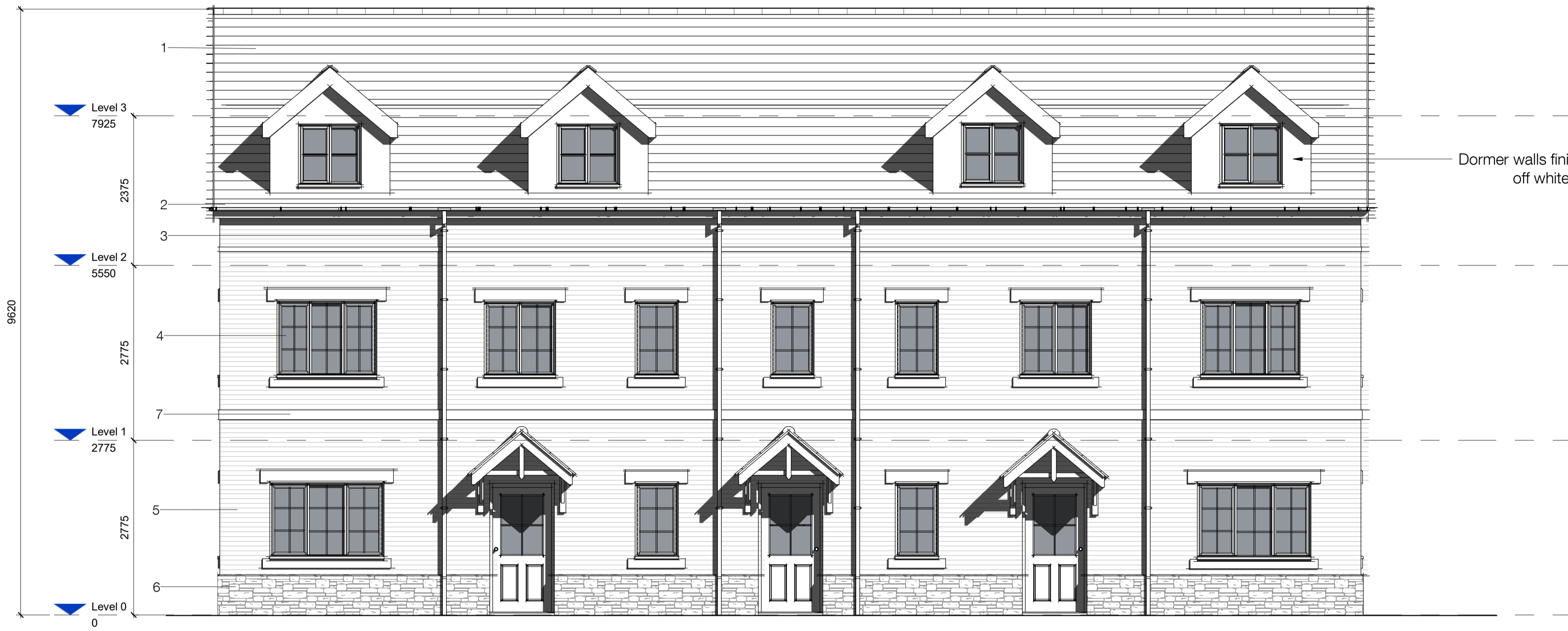
Front elevation (Block 1 & 2) 1 : 50