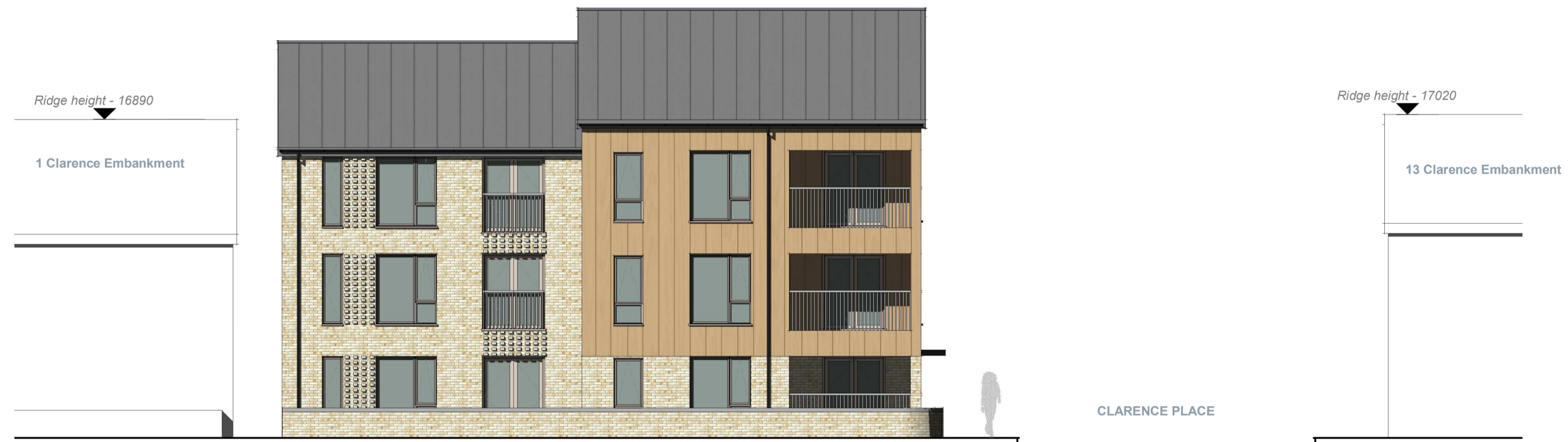
01 Elevation 1 - a 1 : 100

Notes: Do not scale this drawing. Check all dimensions on site. Any discrepancies to be reported back to the Architect for clarity.