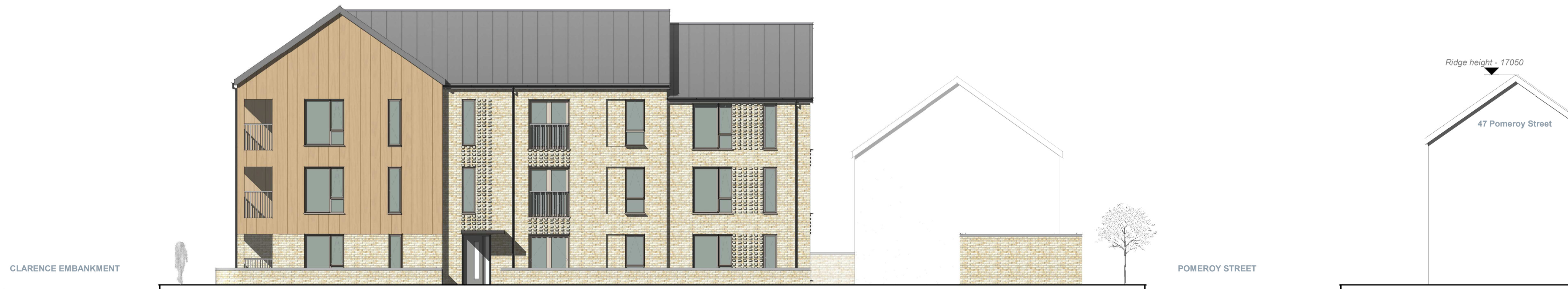
02 Elevation 2 - a 1 : 100