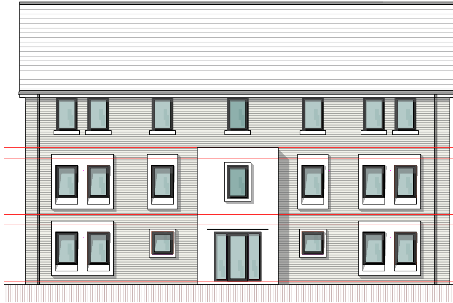
BUILDING TYPE A: FRONT ELEVATION