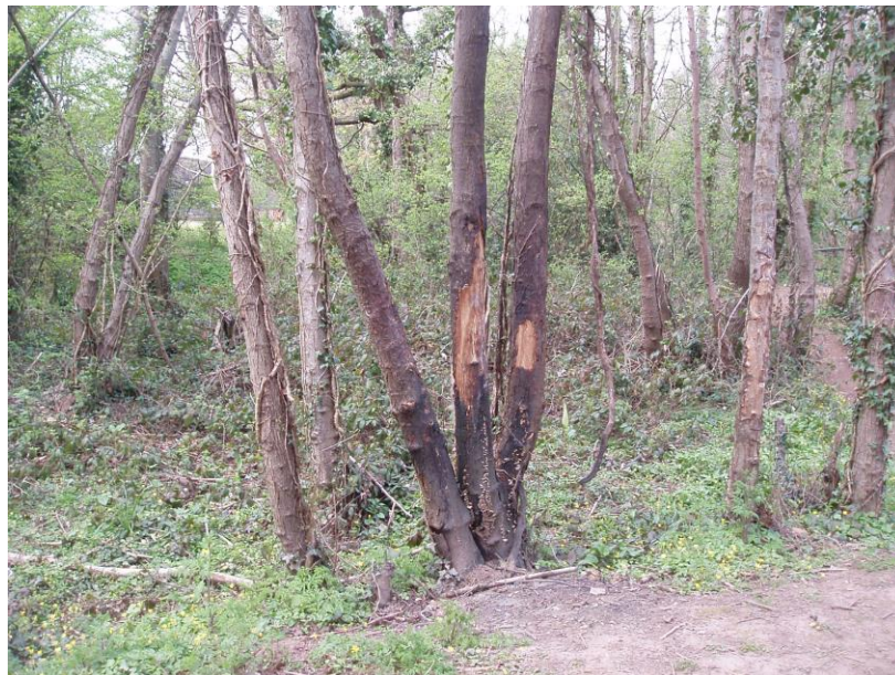
Woodland at Target Note 4 showing high levels of disturbance