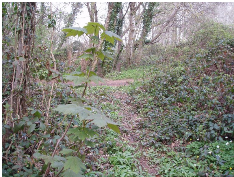
Woodland at TN4