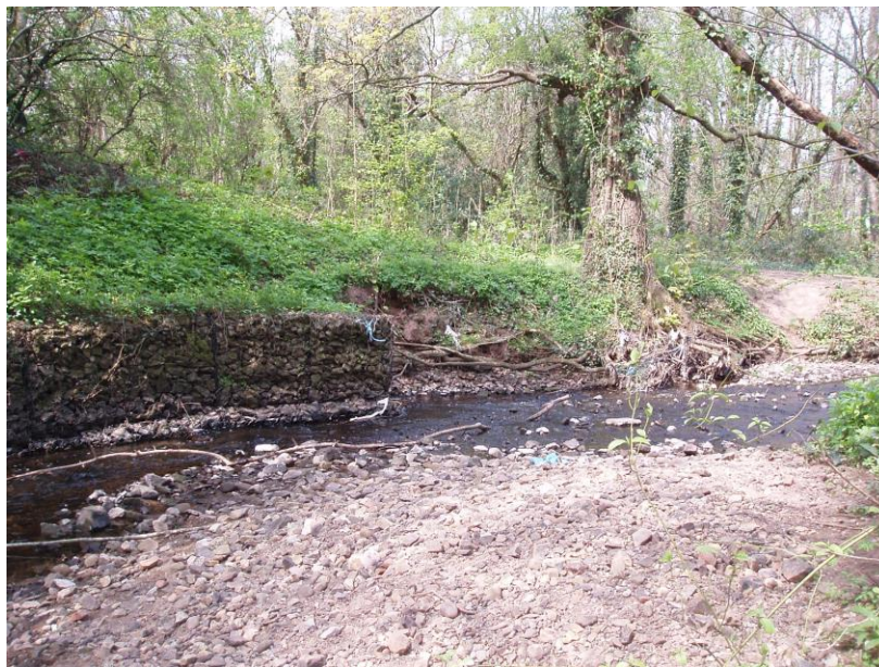
The Dowlais Brook downstream of the footbridge