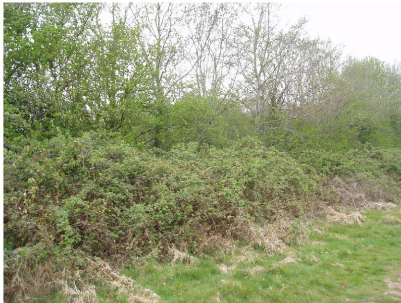
Field boundaries TN2