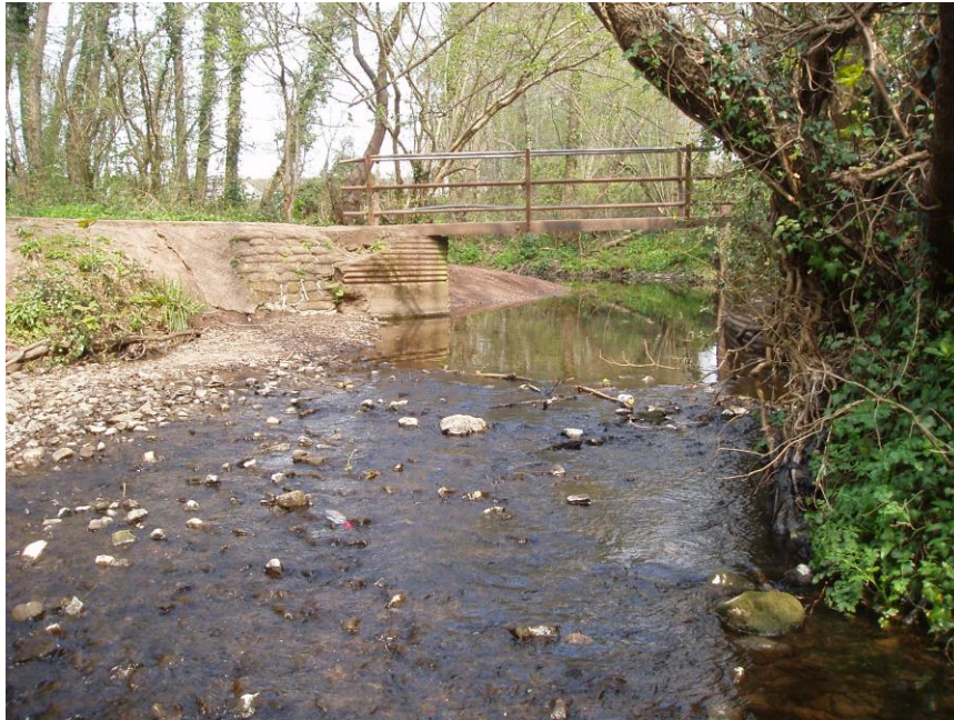
The footbridge over Dowlais Brook TN5