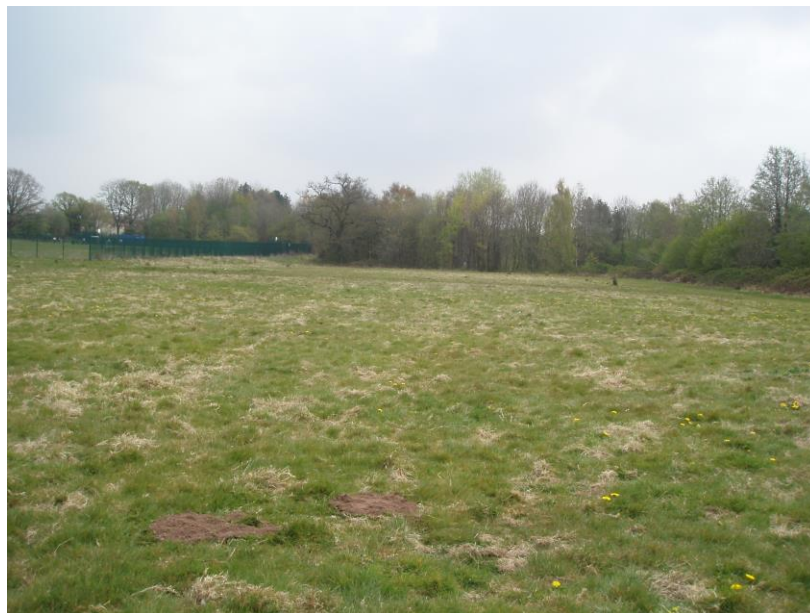
The playing fields amenity area (TN1)