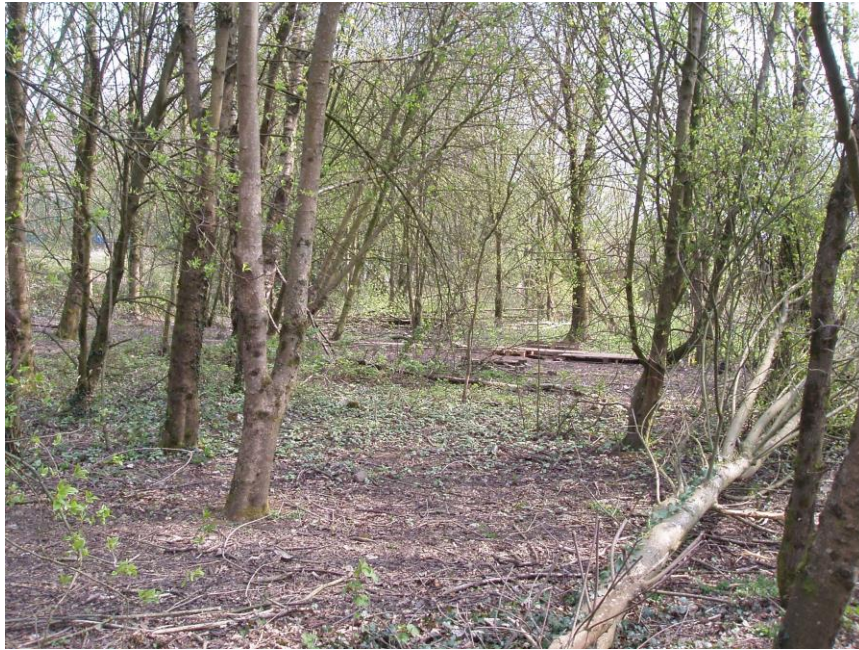
Planted woodland at TN3