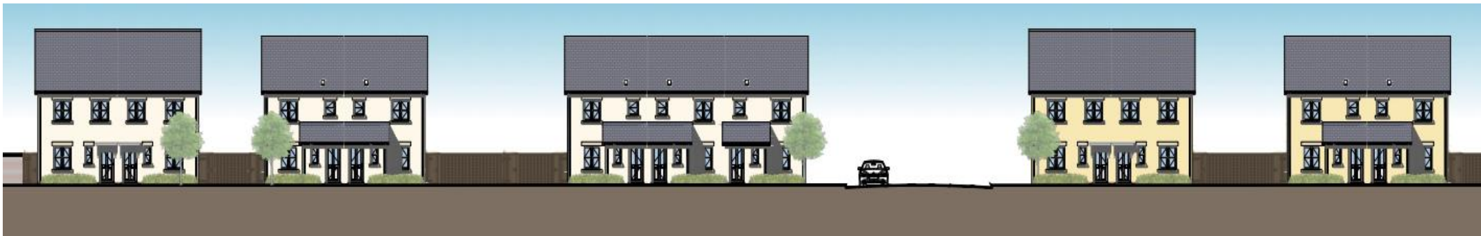
5.0 STREET SCENE 2 OF 2