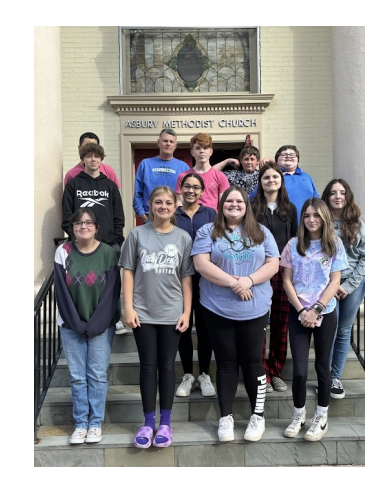
Camp Bays Mountain Mission Trip Our youth went to Camp Bays Mountain to help prepare for the summer camp. Lots of hard work and fellowship.