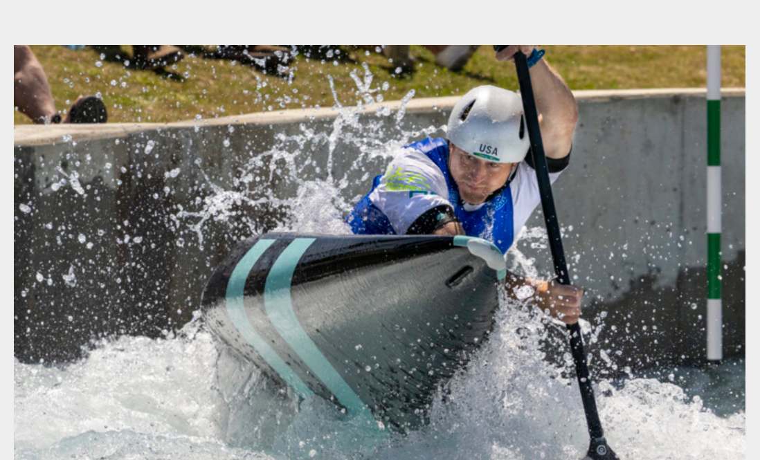
APR 22, 2024 Watch the 2024 Canoe Slalom Olympic Team Trials Live on NBC!