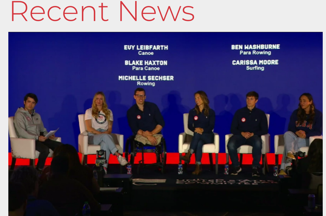
APR 22, 2024 Team USA Media Summit 2024 Panel Discussions