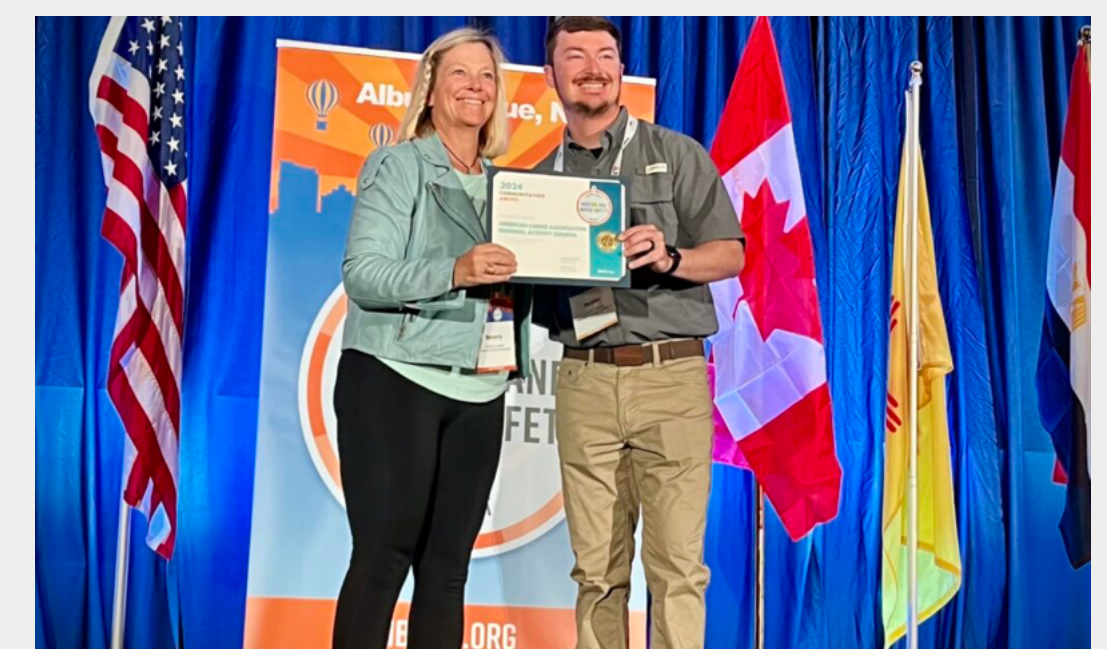
APR 22, 2024 ACA Regional Activity Council Receives Communications Award at the 2024 IBWSS for Community Impact