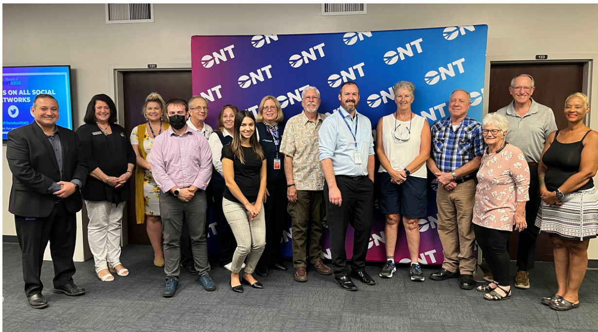
The Friends of ONT from our June 16 meeting