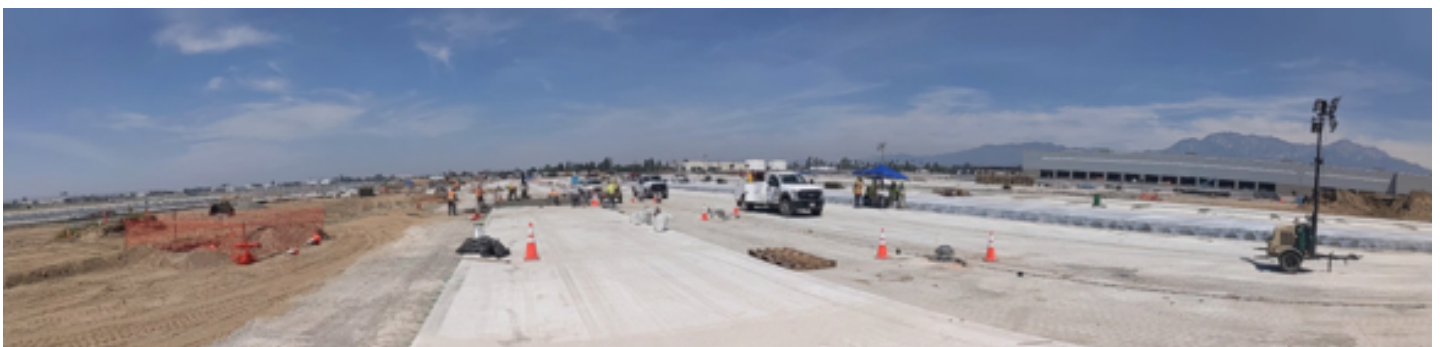
New aircraft parking apron areas, sorting facility and Taxiway A, May 2020