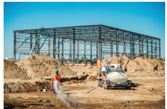
FedEx Sorting Facility Building, June 2019