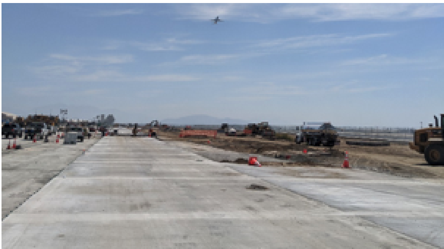
Taxiway A, April 2020