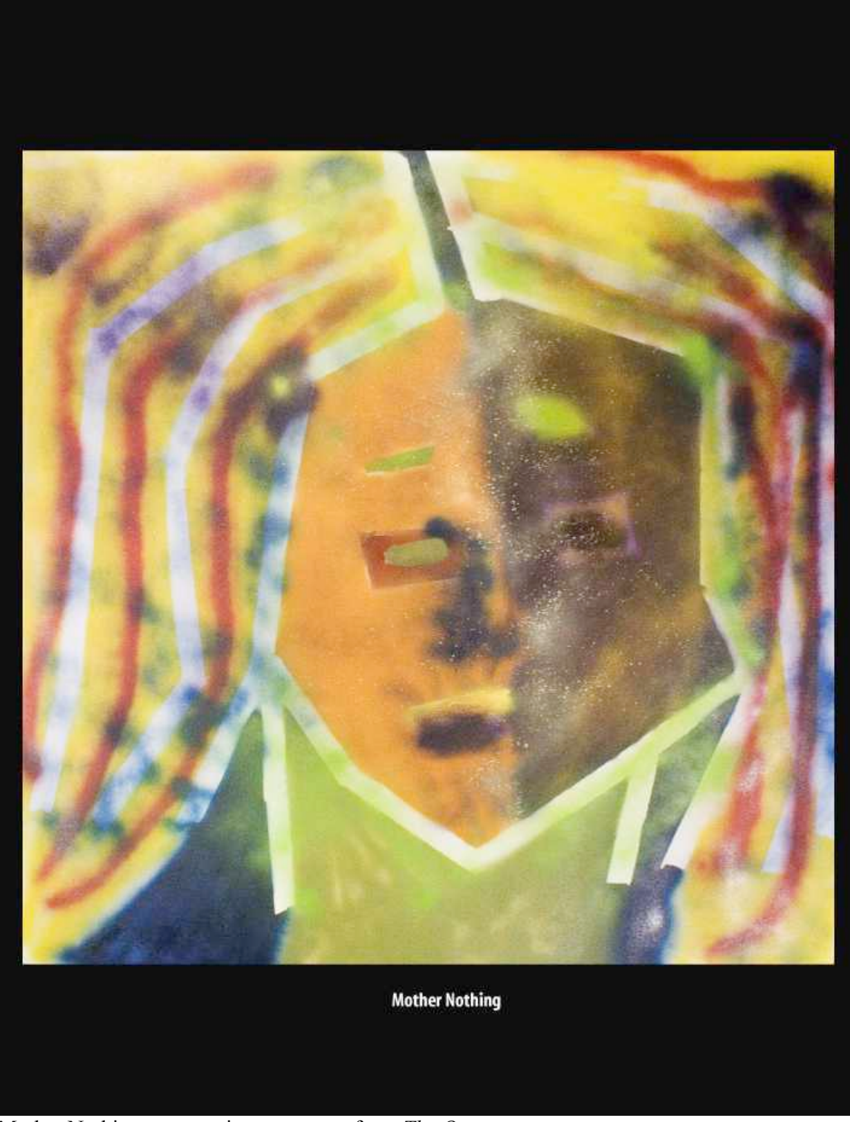
Mother Nothing, spray paint on canvas, from The Ones