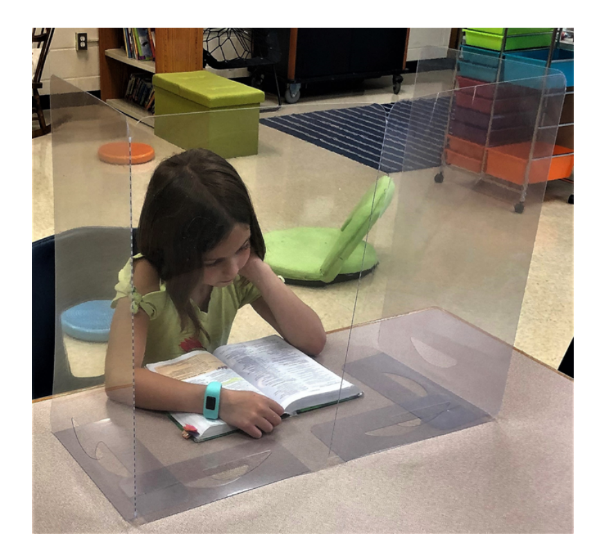
Folded Size: 11.75" wide x 20" long x .5" thick

OnSpec Stock and custom displays are designed with safety in mind. Featuring the "NEW" MobileShield. This Patent Pending design is created to offer personal protection for students in multiple environments. Easilyfold up for backpack and locker storage.