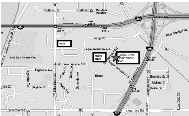
Coca Cola Bottling Works Location Map