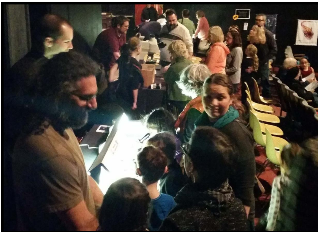
Many happy visitors packed in to see our demonstrations.