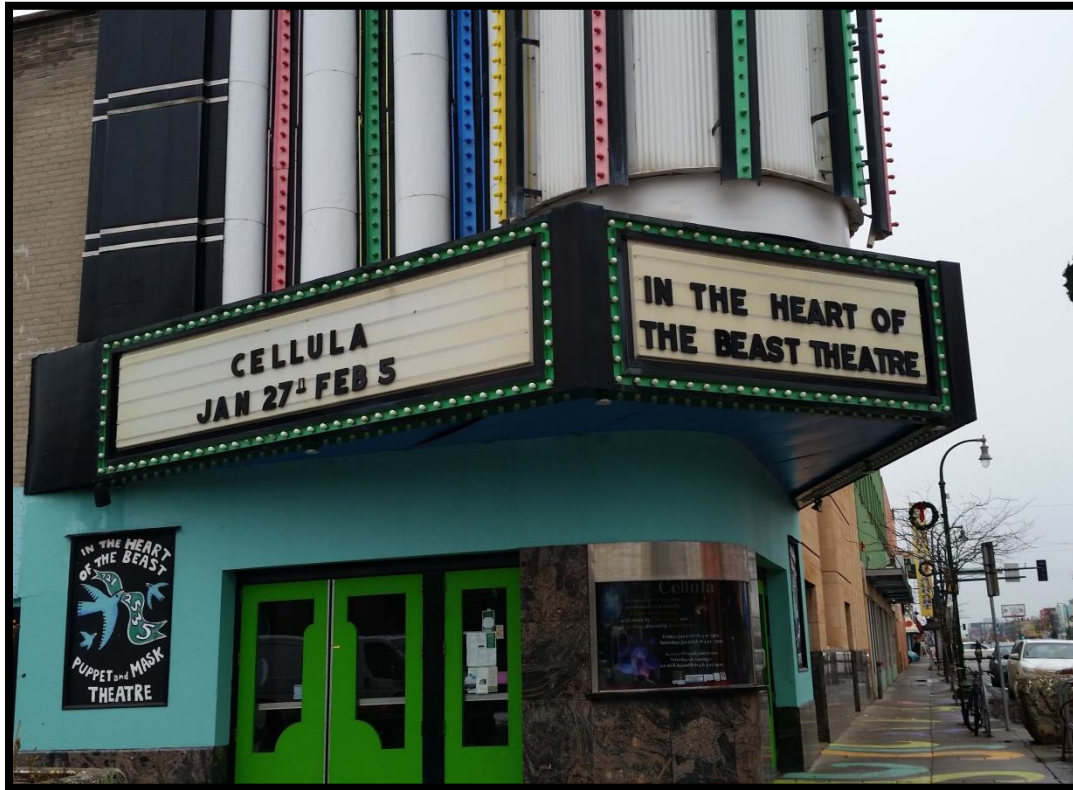
In the Heart of the Beast Puppet and Mask Theatre marquee featuring Cellula ..