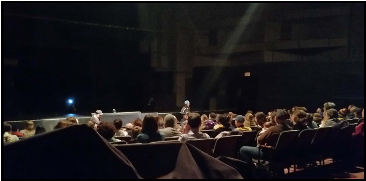
Libby Turner and Mankwe Ndosi, Z Puppets a capella singers, performing in front and encouraging the audience to sing with them.