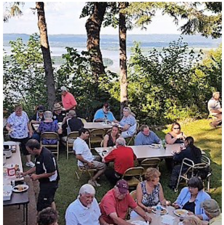
The view from Jansky's over the Mississippi River