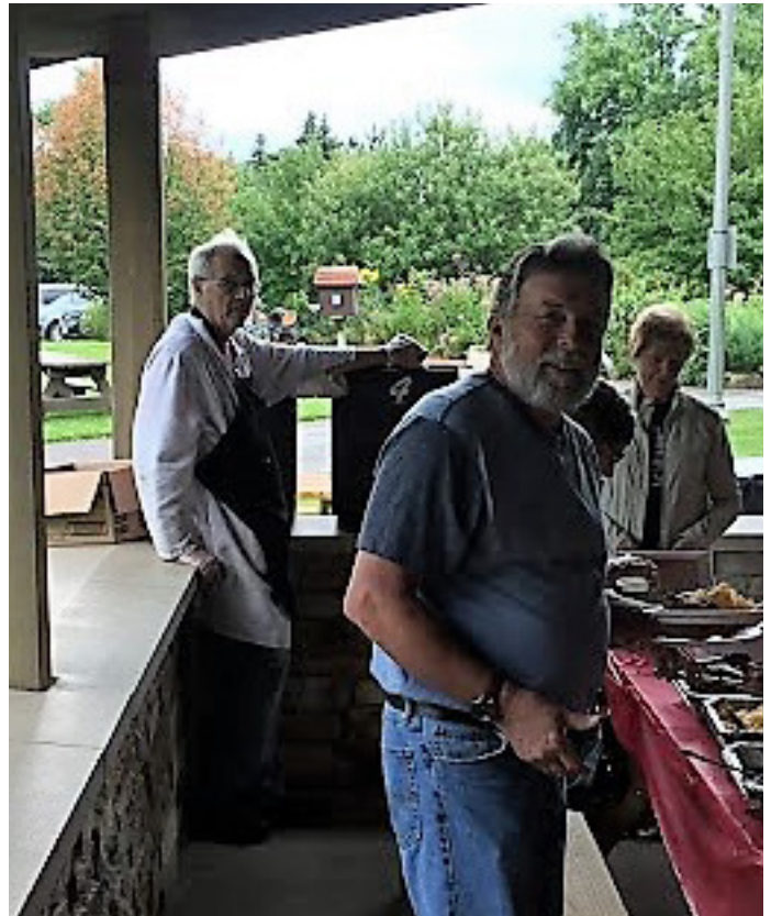
Cooking up for everyone at Summer picnic