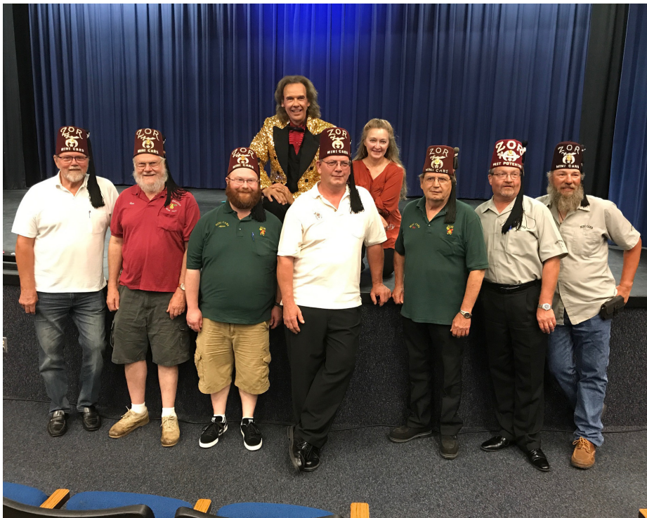
7 members of the Mini Cars, along with several members of the Rock County Shrine Club worked the variety show on June 30th at Beloit Turner High School. There were about 30 people in attendance count was 30