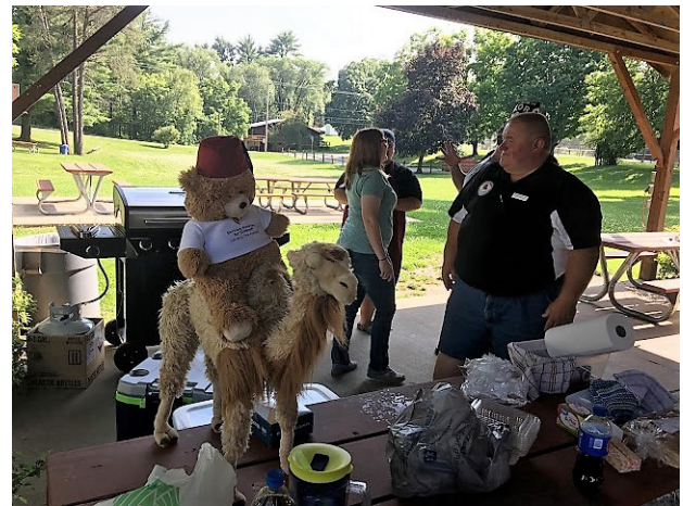
VacationLand Shrine Club Steak Fry