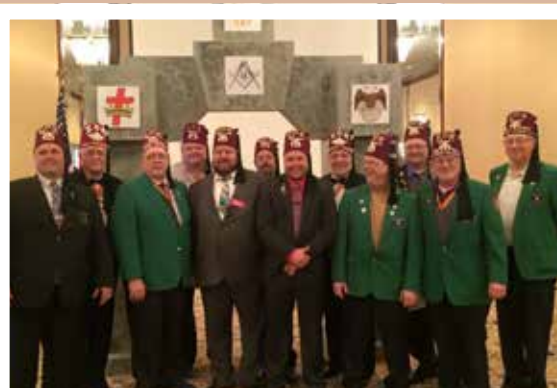
Nobles from St. Croix under the arch.