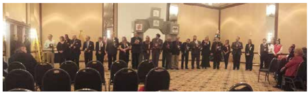
All the new Nobles Nobles about to get "fezzed".