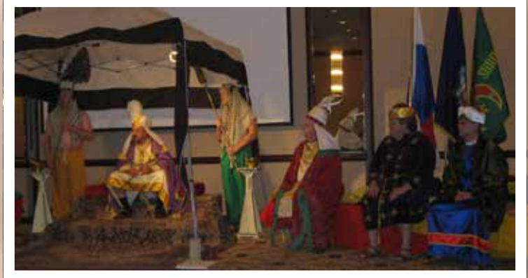
The Ritual Divan team.