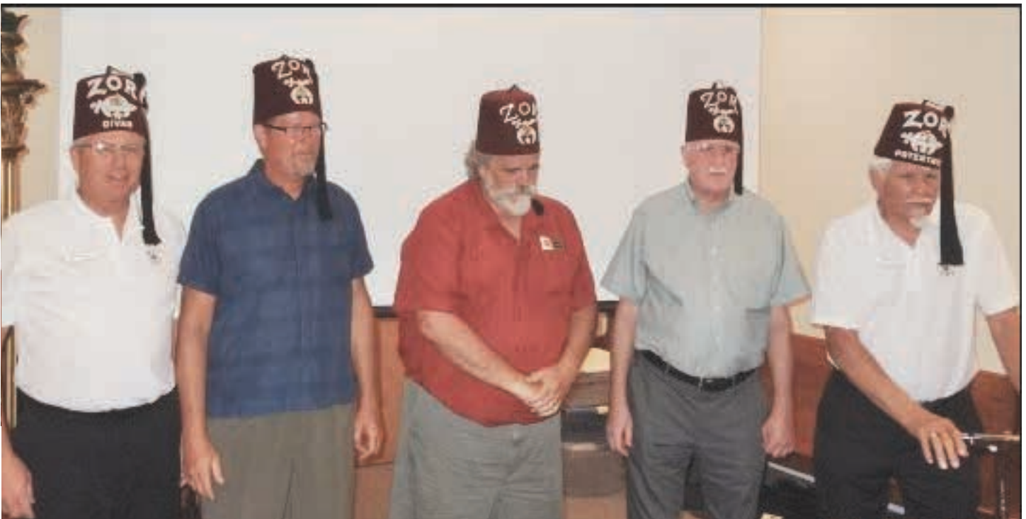
Rice Lake brings in two new members