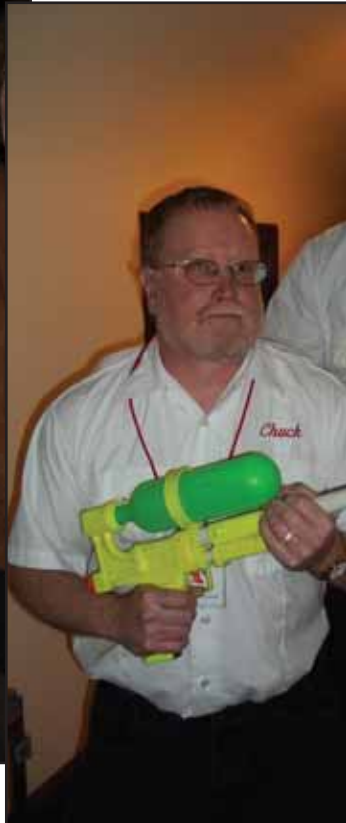
Below, the Directors S as usual.