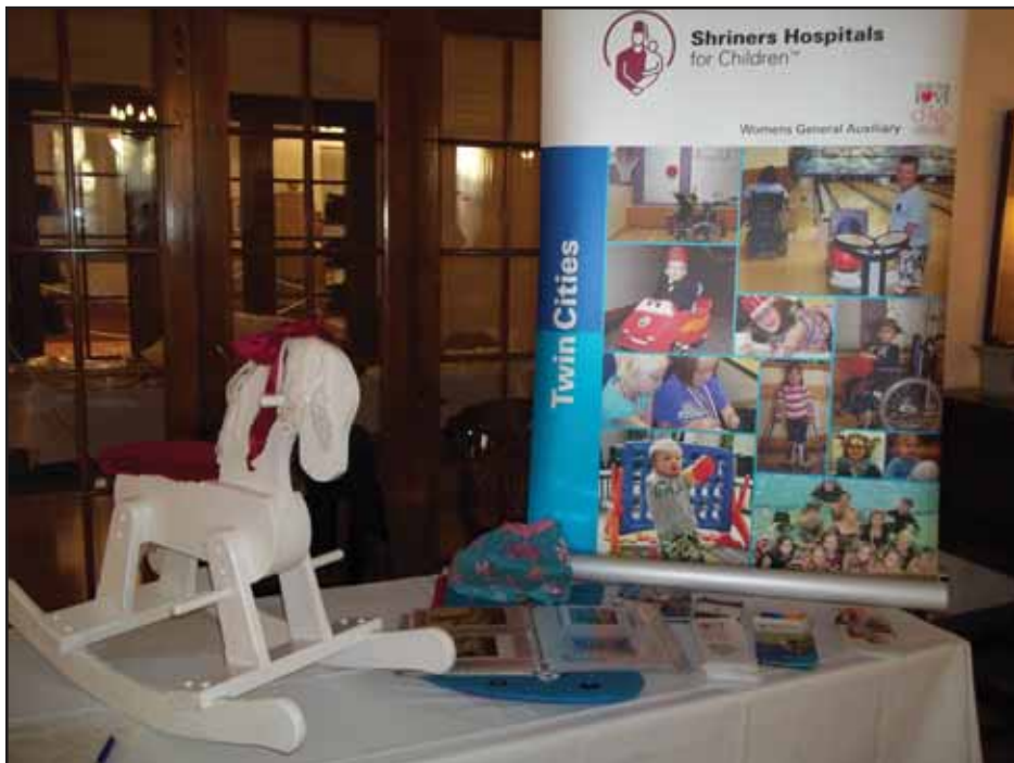
One of the many displays set up around the Ceremonial.