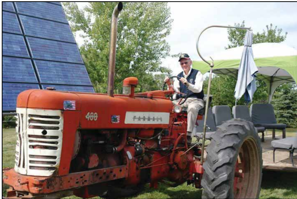
Riding off into the sunset...