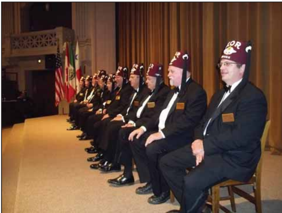
The Divan enjoying the Parade to Glory presentations.