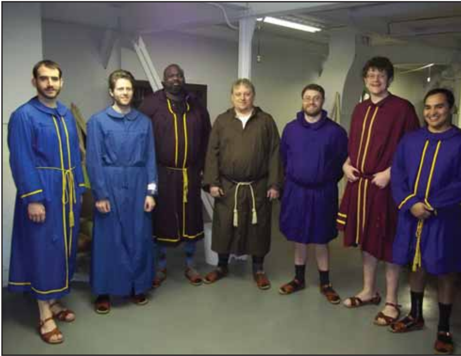
Candidates getting ready for the Ritual Divan presentation.