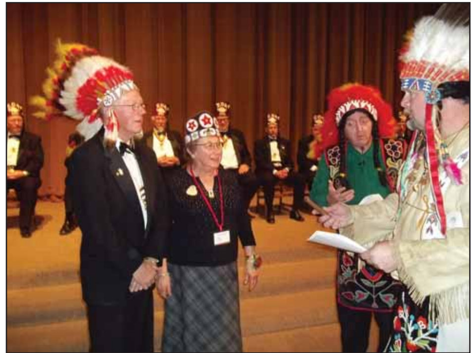
The Wausauken Indians welcomed some new members into their fold.