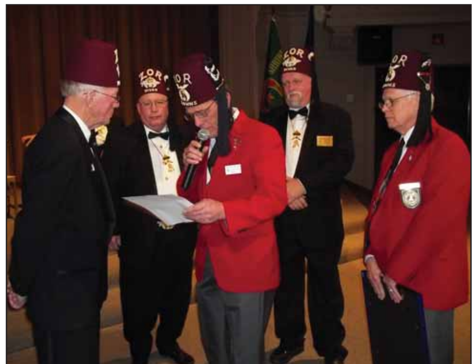
Zor Clowns making their presentation to the Potentate.