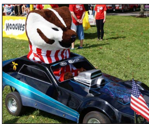
Bucky Badger checking out one of the Mini-cars vehicles at the Monroe Cheese Days parade