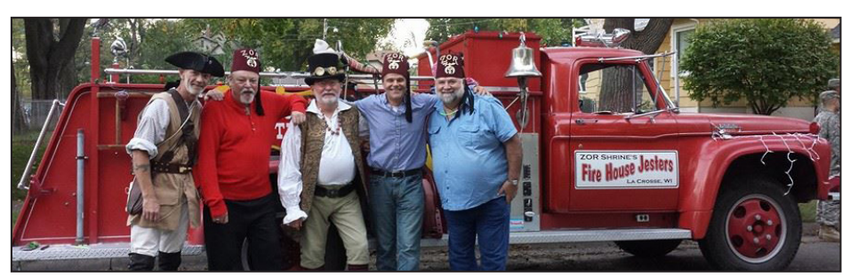
Firehouse Jesters getting ready for the La Crosse Torchlight Parade.