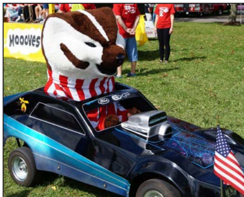
Bucky Badger checking out one of the Mini-cars vehicles at the Monroe Cheese Days parade.