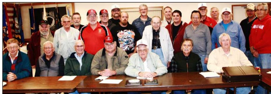
The Roadrunners season wrap up at the American Legion Club in New Richmond.

Zor's Clubs and Units have been busy this summer with lots of pictures to prove it. If you want your club or unit recognized in the Zephyr, please send your pictures with a brief caption to the Zephyr Editor: zorzephyr@tds.net or 1116 Spruce Drive, La Crescent, MN, 55947. Tell us what you are doing so we can share it with the rest of Zorland! If you don't show, we can't tell.