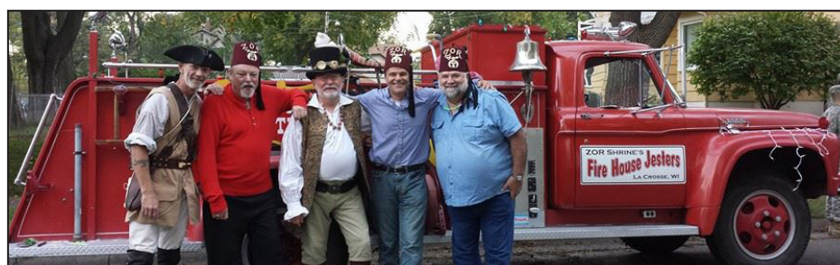
Firehouse Jesters getting ready for the La Crosse Torchlight Parade.