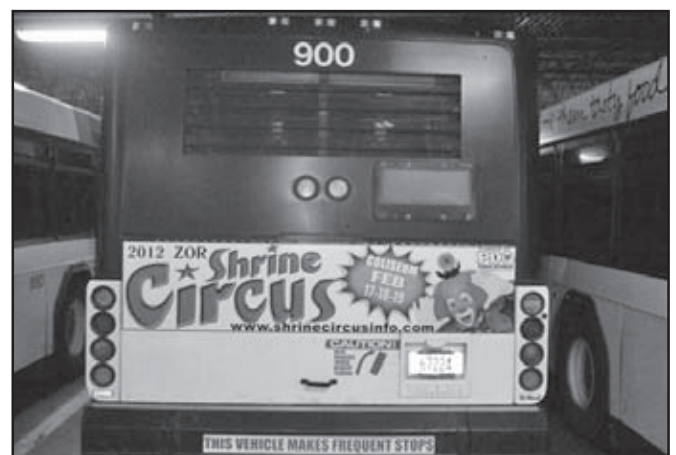
12 Madison Metro buses have this ad!

Come to the circus, the biggest show in town and may all your days be circus days !!