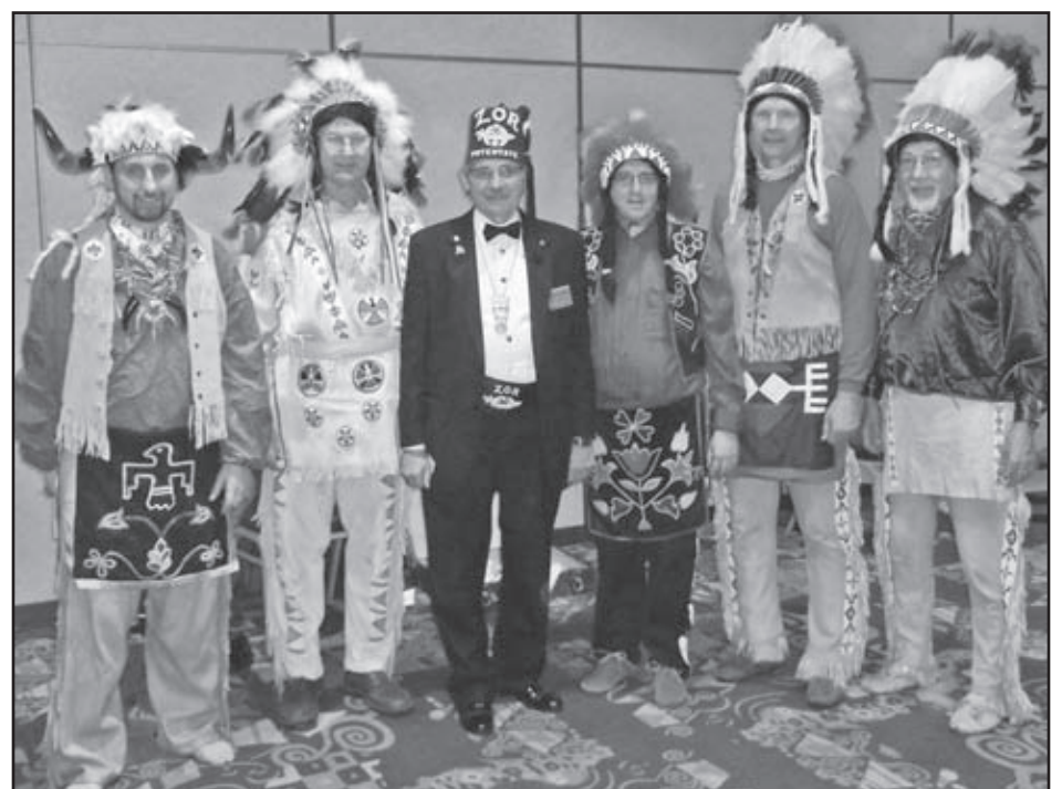
The Wausauken Indians preparing for their annual skit to "honor" the Potentate.