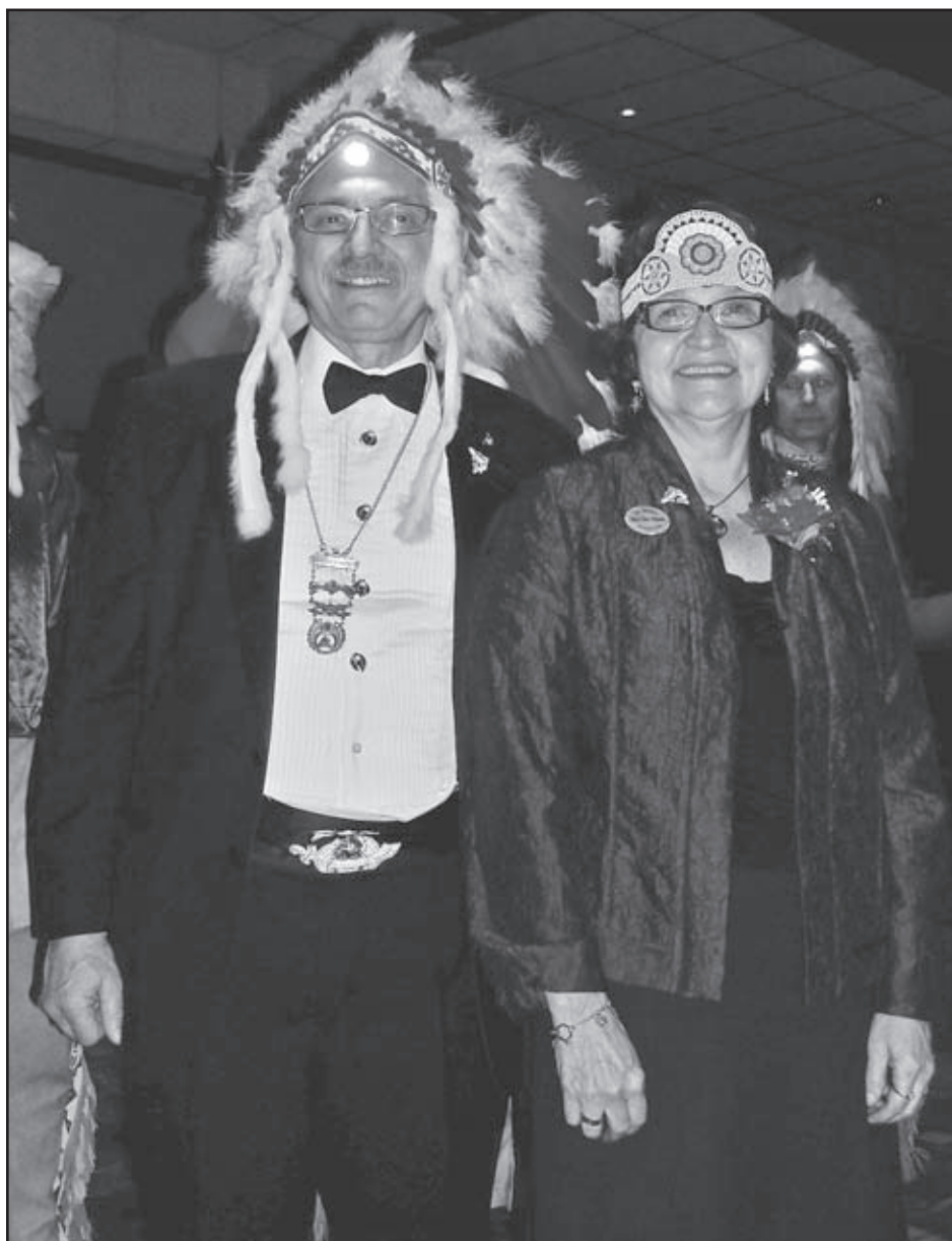
The Potentate and his Lady present their gifts from the Wausauken Indians.