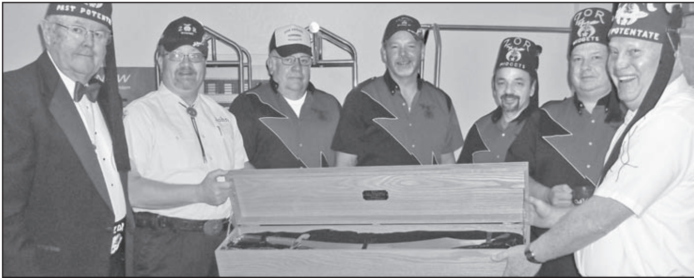
Zor Midgets receiving the Scimitar. Let's see if it fits in their little cars!

The Zor Scimitar is on the move! This mighty blade housed in a handcrafted wood display case is a sight to see and to show off at your Shrine event. The Scimitar was last seen in the Madison area. When your Club or Unit takes possession of the scimitar, please take a picture of the event, get all the names of the Nobles, and email it to zorzephyr@tds.net or mail it to the Zor Office, 575 Zor Shrine Place,