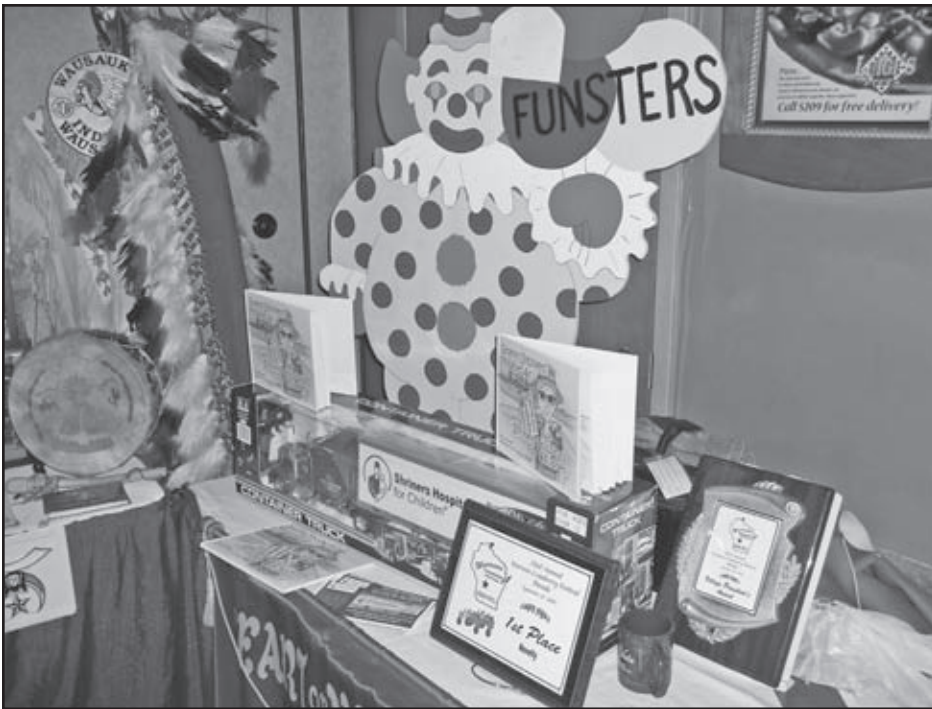
Funsters Clown display. The number 1 Clown Unit?