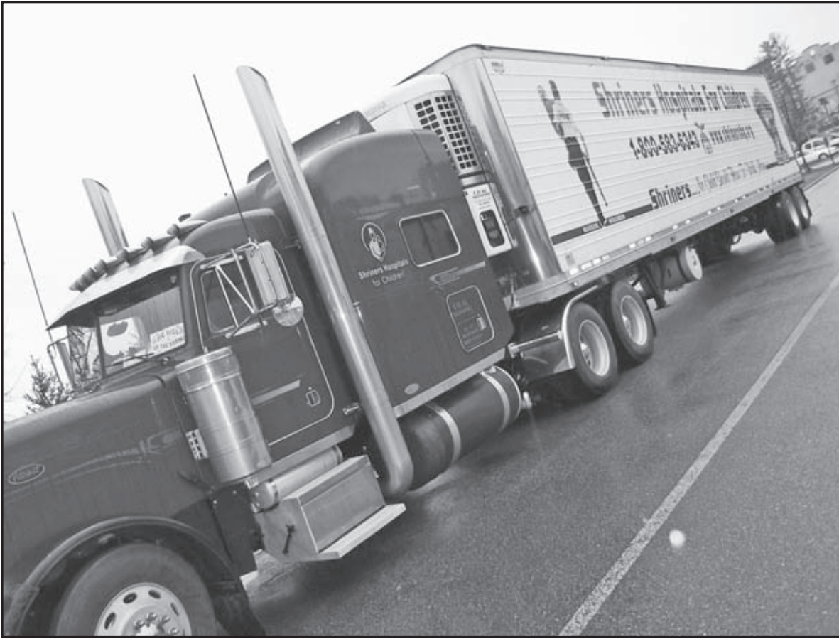
Look for more of these amazing trucks on the road near you!