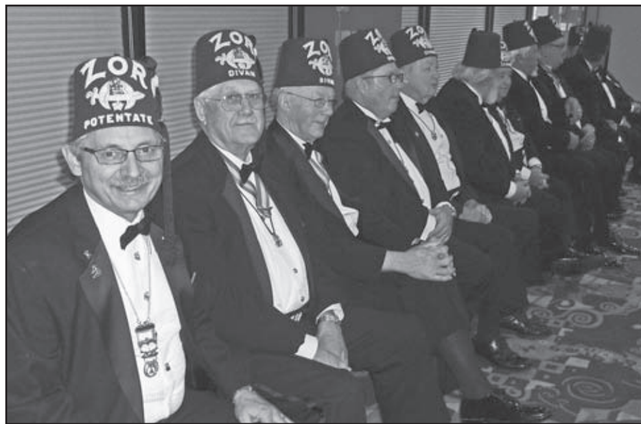
The Potentate and the Divan prepare for the afternoon's events.