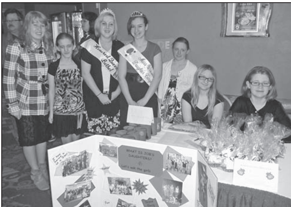
The Job's Daughters proudly display their colors and smiles.