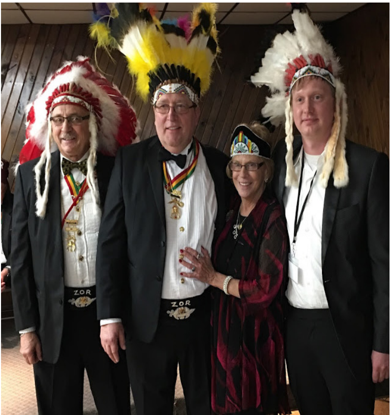
Offical Wauksauken Indian