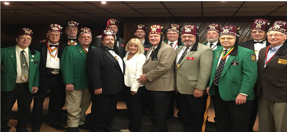
St.Croix Valley well represented at Ceremonial